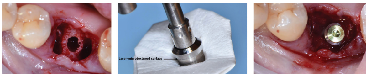
Fig. 1: Preparation of the inter radicular recipient site (right); the membrane is cropped according to the measurements of the post-extraction socket perimeter, and the implant is inserted into the center of the membrane exactly in the transverse area between the surface of the implant body and the laser-microtextured collar (center); simultaneous placement of implant and membrane (right).

In cast models, each horizontal measure was performed with a caliber among the distal, central, and mesial higher point of alveolar buccal and lingual edge. The correlation between the amount of the keratinized tissue thickness (KTT) with EMBL was also analyzed. Keratinized tissue thickness (KTT) was recorded before the extractive procedure. The KTT was measured in the vestibular aspect of the molar tooth by means of n. 30 K-file inserted until touching the bone crest. The KTT was dichotomized into two groups ( \leq 2\text{ mm} and >2\text{ mm} ) in accordance with the results of an animal study performed by Berglundh et al. (9), which was the first at-