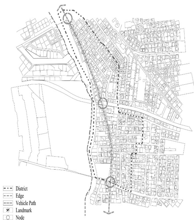
Fig. 2 Lynch Analysis of Dereboyu Street, Lefkosa/North Cyprus

The next level of man-made environment evaluation is the Lynch analysis that is initially used to define the image of the Dereboyu Street. According to Fig. 2, there is a strong vehicle path. The street is facing with car traffic during rush hours. There is not a positive pedestrian connection between the street and other parts of the city; those who are walking are coming with their cars, and lack of car parking is turning the sidewalks and the spaces between buildings into parking lots.