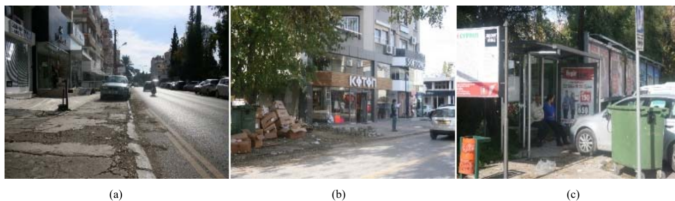
Fig. 4 (a) Pedestrian quality (b) cleanliness of the street (c) street furniture and bus stop location, cars blocked pedestrian path

The functions of street include; shops, restaurant, offices, residential, hotels and other facilities. Organization of functions is random through the street, and relationships between the residential parts and other functions are weak. The street is not serving the daily needs of the nearby residents; due to this fact, local people who can access the street by walk do not use the street efficiently. Despite this weakness, the street seems to be attractive for the public in terms of 'brand shops', 'restaurants', 'cafes', 'banks', and 'offices'. The facade of the street is covered by different types of buildings in different height levels between 1 and 6 stories. There is no unity among them in terms of facade, height, material, etc. (Fig. 3 (a))