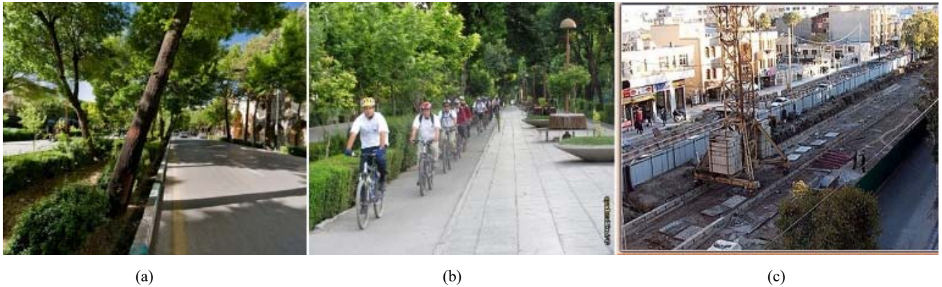
Fig. 7 (a) Vehicle path (b) Bike and pedestrian path (c) Subway construction, [30]

Chaharbagh Street has been known as a multifunctional street specially used as shopping and entertainment space. Multifunction of street has made this it live street in 24 hours of 7 days. Also existence of historical and monumental buildings in this street present the space as an identifiable street which is memorable for users even the once visiting. Façade of the street made by this building has unity along the street, even they were for a different historical period. The height level of the buildings is average between 1 to 3 stories