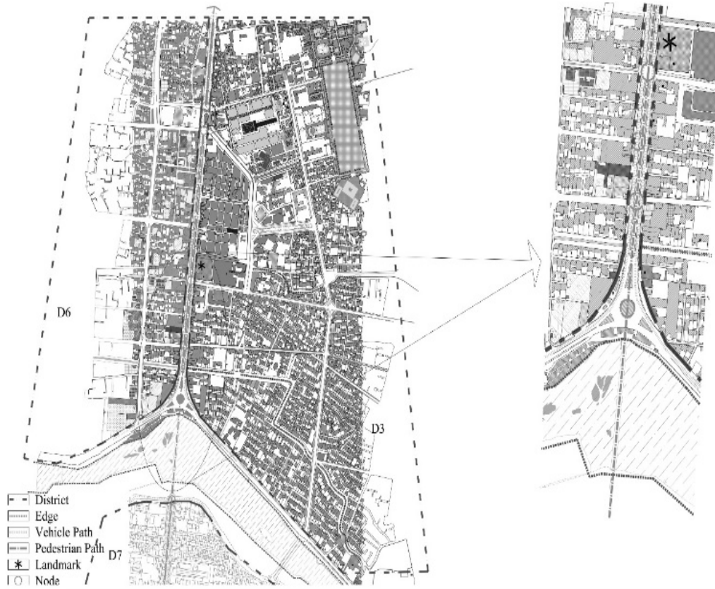
Fig. 6 Lynch analysis of Chaharbagh Street, Isfahan/Iran

some parts of pedestrian paths and also damages landscape and greenery of the space (Fig. 7 (c)).