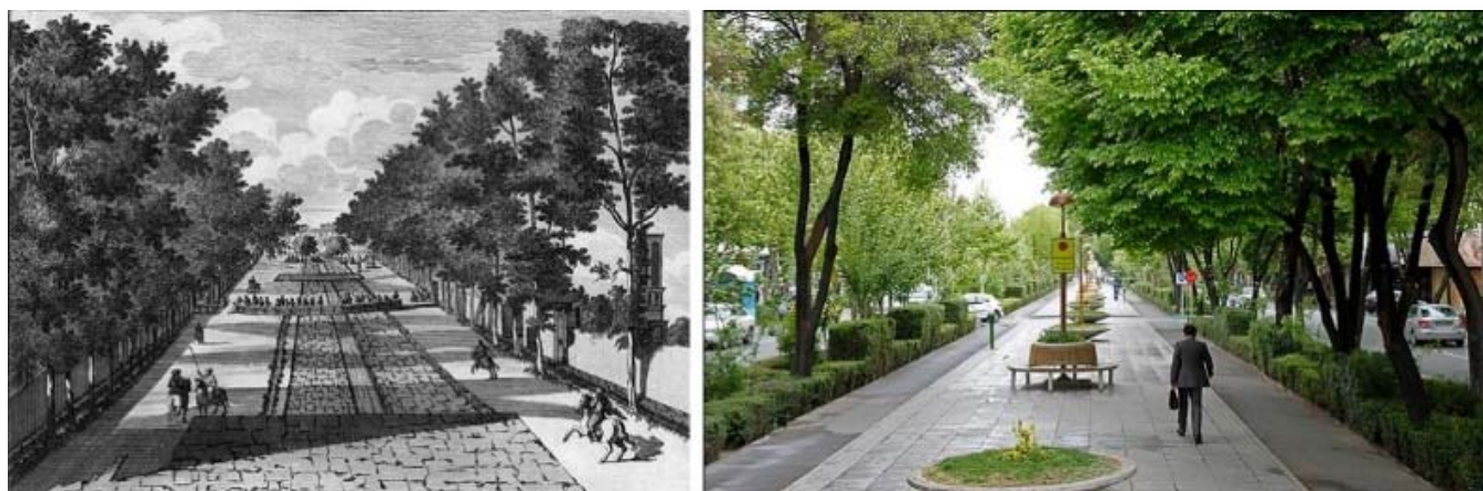
Fig. 5 Chaharbagh Street past and currently conditions [29]

As mentioned before, Chaharbagh Street is one of the historical and important streets in Isfahan. Isfahan is located in the Zagros foothills. The climate of the city is long hot-dry summer and cold-dry in winter. Chaharbagh Street, whose names come from Four Garden, has been designed based on Persian Gardens to make balance between hard climate and human thermal comfort condition. The street continues by a mild slope toward the Zayandeh Rood River. In Safavied period, there was a stream at the middle of the street. Unfortunately, later the stream was blocked and lost its positive effects on the environment (Fig. 5).