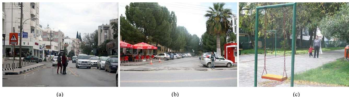
Fig. 3 (a) Pedestrian and cars in conflict (b) Entrance of park as a parking lot (c) Park as a pleasant pedestrian path, and lack of functions around it

fences, and the entrance of the park is occupied by cars. Also, there is no significant landmark exists in the street in order to use for orientation. (Figs. 3 (b), (c))