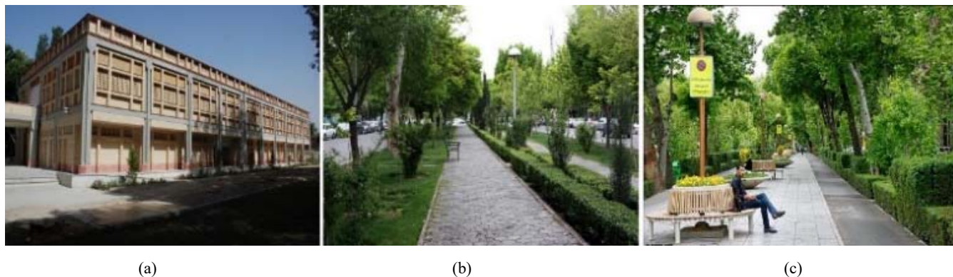
Fig. 8 (a) Renovated facade of Chaharbagh Street (b) New development section of Chaharbagh Street (Southern part) (c) Street furniture

Chahrbagh Abbasi and Chaharbagh Paeen (Lower) have a same and simple landscape design which clarified the vehicle path in parallel by pedestrian path that made a place in accordance with human thermal comfort for users. But the in pedestrian path of Chaharbagh Bala (southern part) which is more newly developed part by different building characteristics, designers made some changing in design to create different and attractive place for users (Fig. 8 (b)).