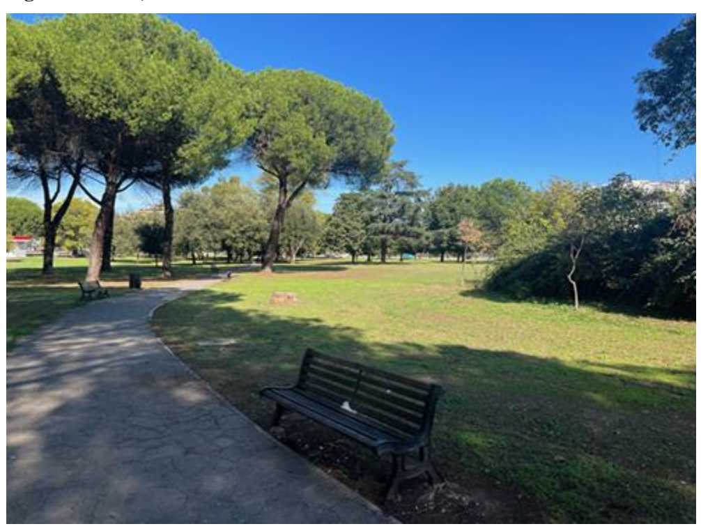
Figure 4. Rome, Mario Picchi Park