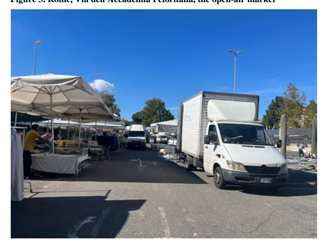
Figure 3. Rome, Via dell'Accademia Peloritana, the open-air market