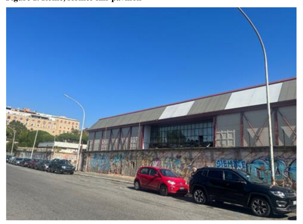
Figure 1. Rome, former fair pavillon