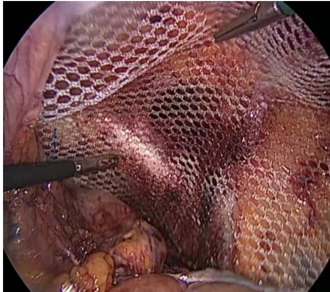
Figure 2: Placement of a non-resorbable mesh in the preperitoneal position.