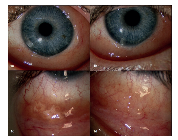
Figure 1. a, c. Bilateral conjunctival lymphoma, right eye. b, d. Left eye. a, b. Diffuse, slightly elevated, salmon-colored mass in the bulbar conjunctiva. Clinical appearance before. d, c. After systemic treatment.

mors are uncommon. Epithelial tumors of the ocular surface can be further subdivided in non-melanocytic or melanocytic ( table II ). The cornea is frequently invaded by tumors originating in the conjunctiva.