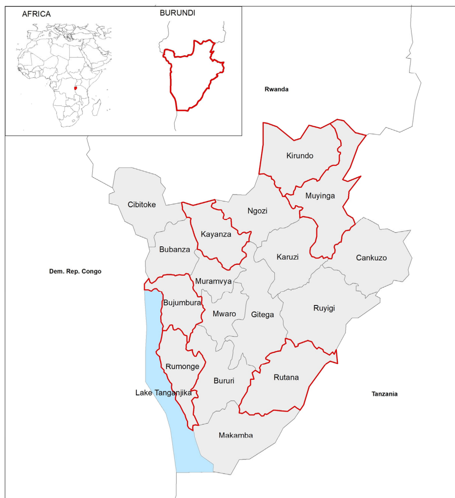
Figure 1. Geographical localization of Burundi, and areas of the study. The colored lines enclose the areas where the study took place.