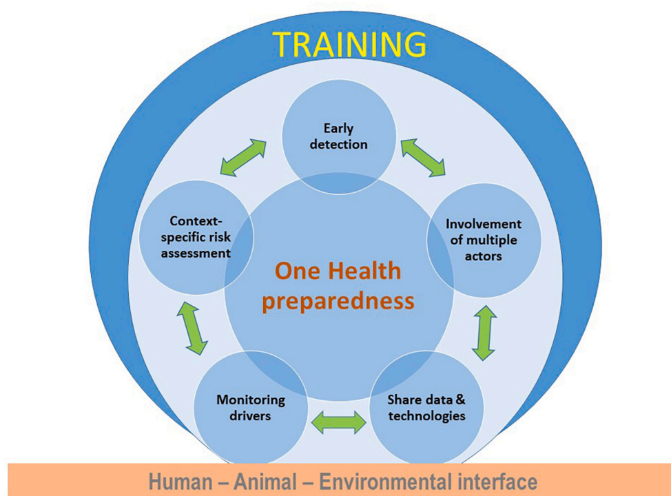
Fig. 1. Pillars of preparedness enhanced by multisectorial & multidisciplinary approaches at the human-animal-environment interface.

The COVID-19 pandemic has highlighted how preparedness