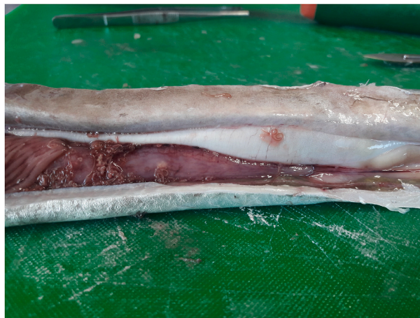
Fig. A.1. Hysterothylacium amoyense third stage larvae in situ in the viscera of Trichiurus lepturus .