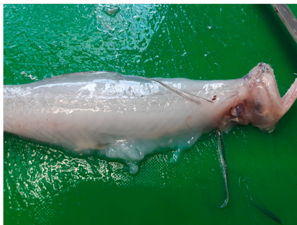
Fig. A.2. Hysterothylacium amoyense third stage larva in situ in the muscle of Harpadon nehereus .