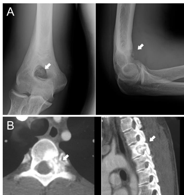
Figure 1. (A) Twenty-two-year-old male patient affected by stage 2 distal humerus OBL (white arrows): the lesion was considered suitable for intralesional surgery; (B) twenty-one-year-old male patient affected by a D3 left pedicle OBL (white arrows): wide resection was performed to decrease the risk of local recurrence.

Radiotherapy is also considered for the treatment of OBLs located in the spine or sacrum, where wide resection is difficult and the risk of complications and loss of function is consistent [16,17].