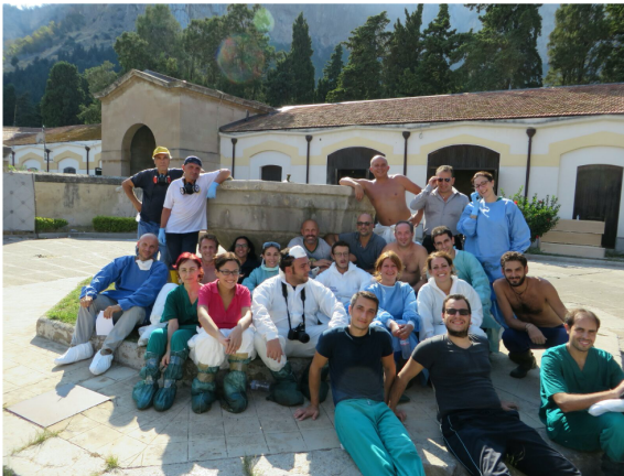
Image 3. Photograph of the whole team during forensic operations in the cemetery