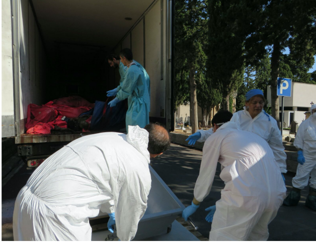
Image 2. The forensic team whilst unloading the refrigerated van

infrastructure, then disappear. Looking at the how the movement and circulation of bodies comes about in the identification endeavor, discloses an infrastructure that is more fluid and flexible than what we may think, a process that adjusts according to specific needs emerging in a particular time and place. A creative infrastructure, we could say.