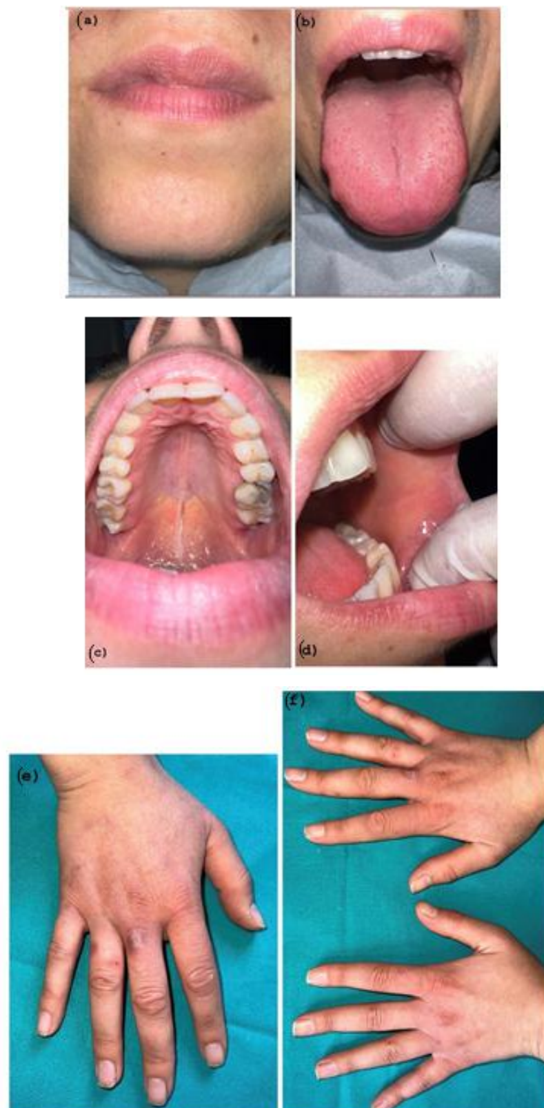
Figure 5. (a–f) Complete remission of the oral manifestations after 3 weeks. All the mucous and skin lesions regressed.