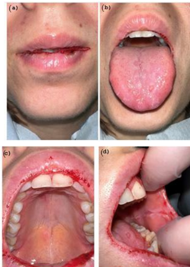
Figure 4. Cont.

Complete remission of the oral manifestations was observed 3 weeks after initial admission to our Department (Figure 5).