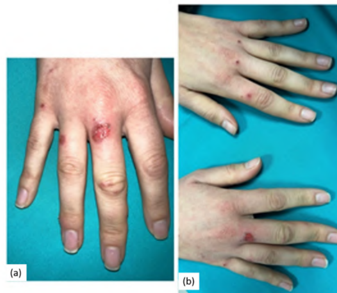
Figure 3. (a,b) cutaneous “target” lesions on the hands; since they have a typical poly cyclic or annular appearance with central erythematous-violet disc and a pink halo separated by a pale intermediate ring.