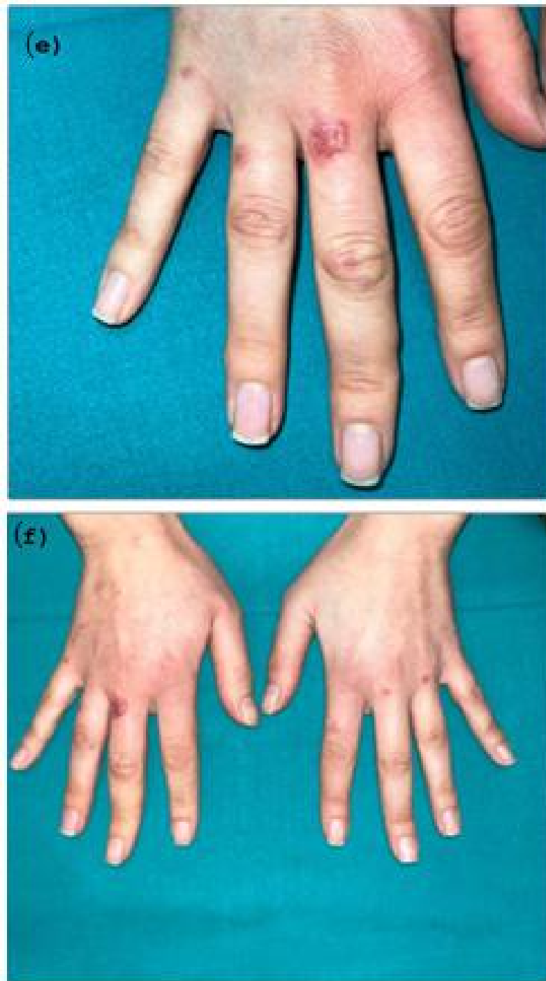
Figure 4. (a–f) Partial Healing wound after 5 days of Corticosteroid therapy. Hemorrhagic area and target lesions are still present.