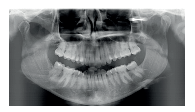
Figure 5. Panoramic x-ray of the same patient.

This pilot study presents a too exiguous sample size of cases; it is necessary to extend the study at more esophageal achalasia patients in order to obtain significative results. Taking into account the limitations of a research based on small numbers, it nevertheless seems advisable to assert that there is a correlation between esophageal achalasia and periodontal disease. Noting the results of our study, patients suffering from achalasia should be treated with periodontal care, including a special attention in explaining the etiology of this rare phenomenon. In order to obtain greater data, which can explain a lot of uncertainty, it would also be appropriate to study the differences of the