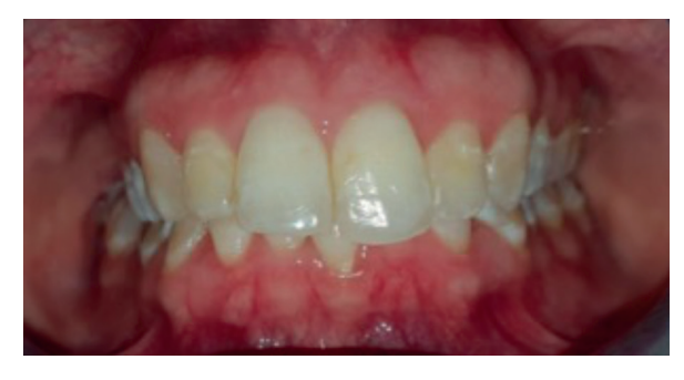
Figure 2. Intraoral photography of a 30 years old woman who has been suffering from achalasia for 13 yrs. - en face.

increases the risk of GERD, which can cause periodontal problems<sup>7,10</sup>. It has also been proven that GERD can cause dental erosion<sup>7,11</sup> and oral soft tissue disorders<sup>11</sup>. Song et al<sup>12</sup> have shown that patients with GERD have a significantly higher risk of having chronic periodontitis. GERD can also aggravate the symptoms that appear. According to the authors, the crucial effect of GERD is a reduced level of salivation, which promotes plaque formation and, as a result, facilitates inflammation in the periodontal area<sup>12</sup>.