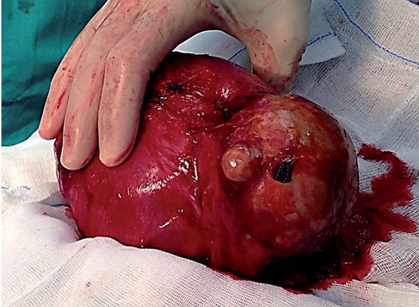
Figure 2. — The residual interstitial pregnancy is the swelling on the left side of the uterus.