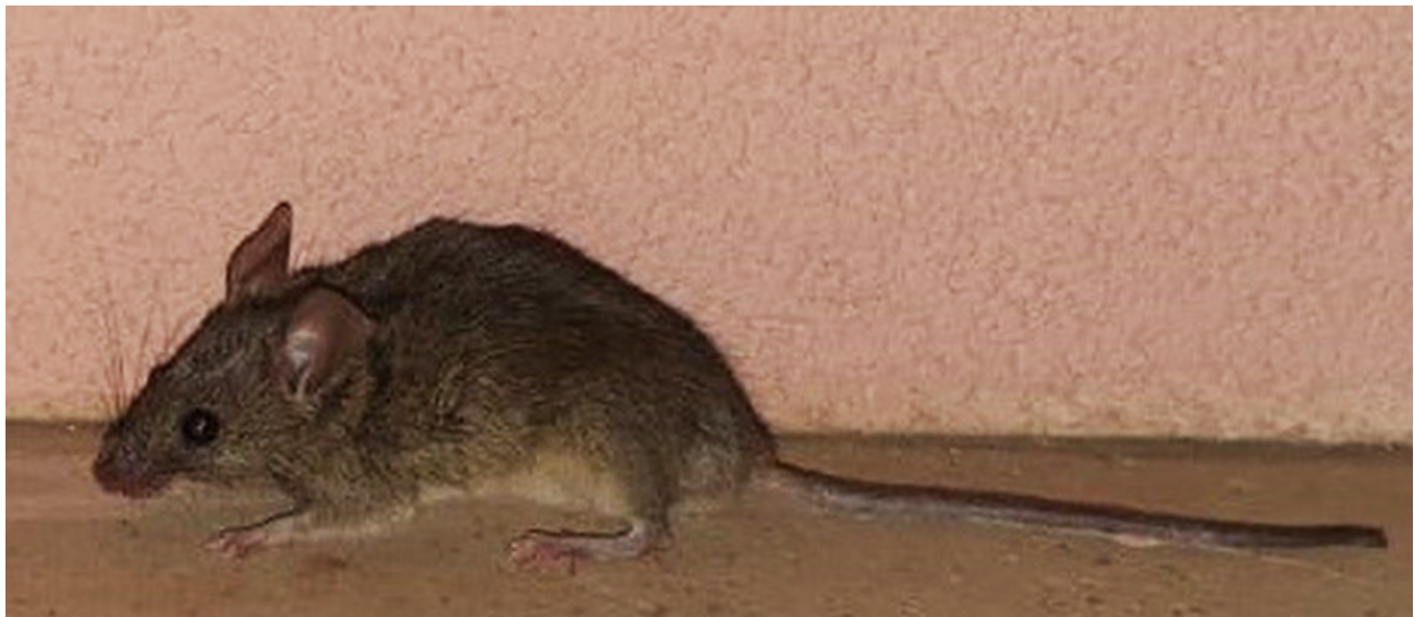
Figure 1. The individual of house mouse sampled in Pantelleria.

In the last case, the individual was handled, and a fragment of 1 mm 2 of ear tissue was obtained through a biopsy punch; afterward, the individual was set free outside the building.