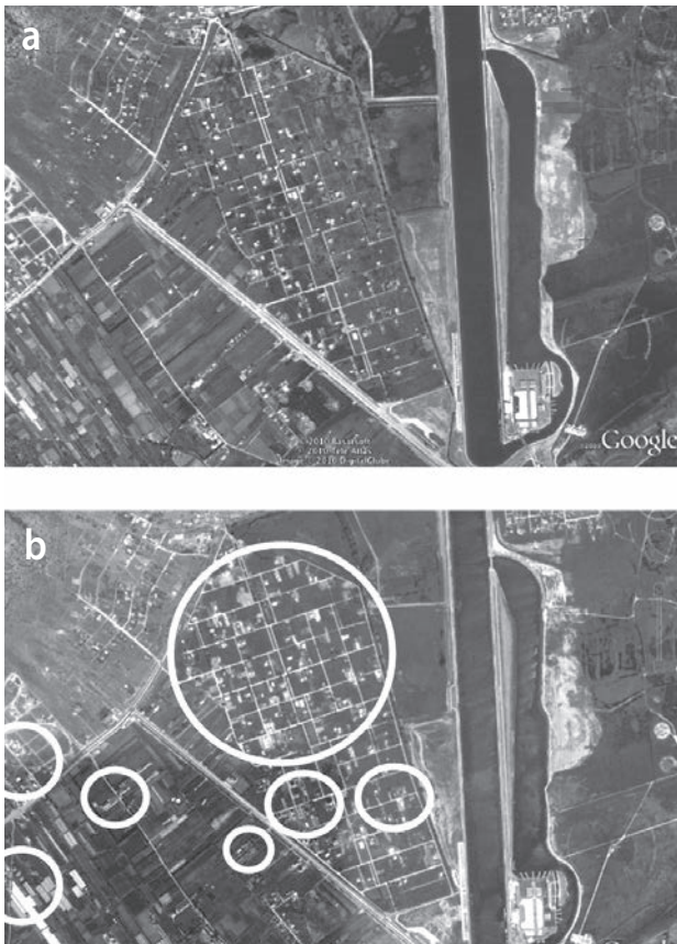
Figure 3: Urban development next to the Olympic Schinias rowing centre: a) in April 2004 and b) in June 2010; leapfrog development is characterised by isolated settlements and small urban nuclei expanding in rural environments. Ribbon sprawl is a typical expansion mode along roads and other infrastructure networks.

driven by sports installations, gave Attica a multi-nucleated spatial configuration, with the formation of clusters around districts that followed a laissez-faire spatial development program in contrast to the expectation of Athens's strategic master plan (Figure 3). The formation of a multi-nucleated territorial asset is particularly evident in the case of the Mesogeia Plain, a vast area that extends east of the Athens conurbation. Mount Hymettus to the west of the area acts as a physical barrier separating the plain from the main conurbation. The beginning of the transformation of the Mesogeia Plain started in the 1980s, when the decision was made to relocate the city's international airport to the area. Subsequent appropriation of agricultural land for airport construction was followed by further infrastructure investment, which was made possible by funds for the Olympic Games. The construction of new roads and rail links connecting the airport with the city significantly improved the area's accessibility. The picture was completed with the construction of two major Olympic venues (the Equestrian Centre and the Shooting Centre, both near the town of Markopoulo), again built on appropriated agricultural land.