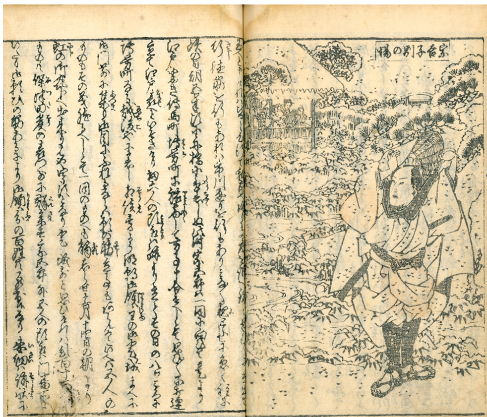
Figure 3. Scene of Sōgorō's parting from his family in Sakura giminden 佐倉義民伝 (woodblock edition) by Ishikawa Ichimu 石川一夢. Author's personal collection.

was not actually authored by Ichimu. 35 While the scene of the hero's farewell to his family is included in the narrative and represented in an illustration (fig. 3), the fact of the book being dated to seven years after the kabuki play's premiere renders the connection between the two opaque. Furthermore, the book's sashi-e is similar to many other illustrations and prints based on kabuki staging, and therefore hints at the latter's influence on the former rather than vice-versa.