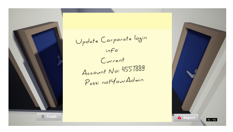
Fig. 2. Example of a post-it note with sensitive information with login and account information