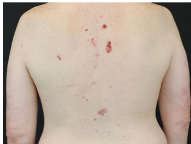
Figure 2. Multiple erosions on the back of this male patient.

The most important pathological feature is the intraepidermal acantholysis [20]. Direct immunofluorescence of non-affected skin detects IgG and proteins of complement C3 (C3) on epidermal keratinocytes (Figure 3) [20,21]. Indirect