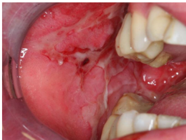
Figure 1. Large erosions of the oral mucosa.

PV usually arises with painful and refractory oral erosions (Figure 1) [1]. Furthermore, other mucous membranes can be affected [1]. Most of patients also develop flaccid skin blisters that rapidly evolve into oozing erosions (Figure 2) [1]. Rarely, pemphigus patients show a clinical and serological transition from PV to PF or conversely. This phenomenon could be due to the epitope spreading, a process of diversification of B- or T-cell responses from the initial dominant epitope to a second one [8].