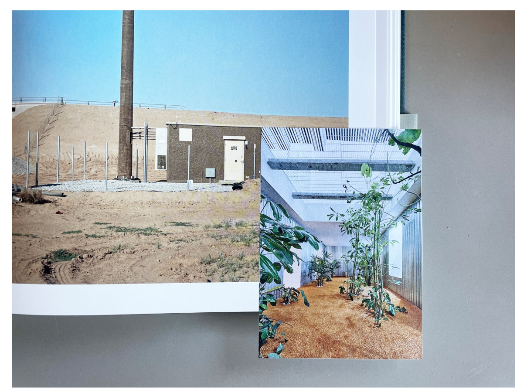
Figure 7. Superimpositions. Lucas y Hernández-Gil, House A12. Tropical Garden

artificiality and declares itself in the desire to alter space and context. The plants stretch out towards the grille and the light and contrast with the metal and the artificial lighting (Figures 8-9). The oasis, as the architects define it, is the metaphysical, surreal space to which the whole house turns, especially the basement, and from which connections are made with the sleeping space, defining the comings and goings between the foreign, exotic place of the courtyard garden and the aseptic space of the bedroom, conceived as separate artificial landscapes which look at each other and contaminate each other in their uses and colours (Figure 10). This is also evident from their words published in the project description for the Mies Award nomination: "A landscaped interior English courtyard that receives light from the street filtered by a latticework creating a kind of oasis, a tropical garden of surreal character is connected to the lower level of the house".<sup>20</sup>