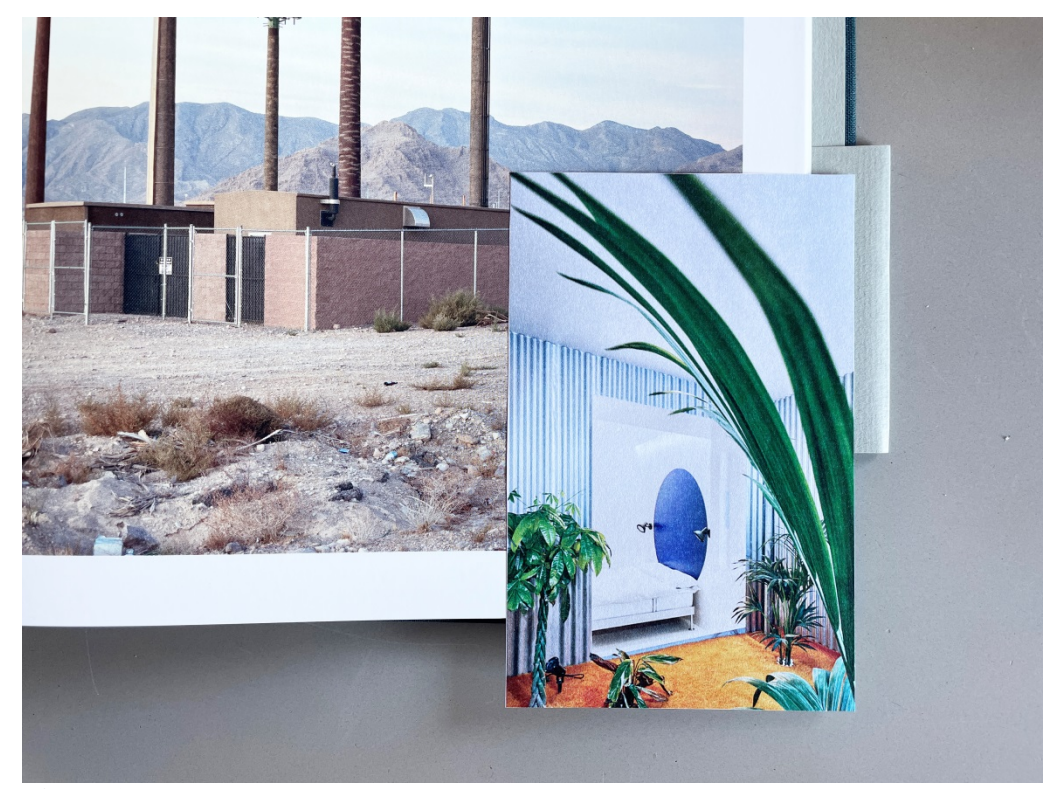
Figure 10. Superimpositions. Lucas y Hernández-Gil, House A12. Bedroom and Garden-Courtyard

Nature in this project is conceived as a design tool capable of enhancing unused or unimportant spaces, such as the courtyard below the atrium facing the entrance on the street, almost a gully, which become places in which to discuss the imagery of the home and increase resonance, thus enhancing spatiality instead of mortifying it. Nature in the project is also a mix of the artificial and the natural, contaminating plants and vegetation from different places as contrasting materials to define a new interior landscape that can rethink the space of the domestic. The oasis of orange carpet, plants and metal directly overlooks the room, making it possible to sleep in an artificial desert, and contaminating a technical space, solving problems of humidity and lighting, with a classic domestic space in which the two looks at each other and define a new interior landscape: a controlled but at the same time imaginative domestic nature.