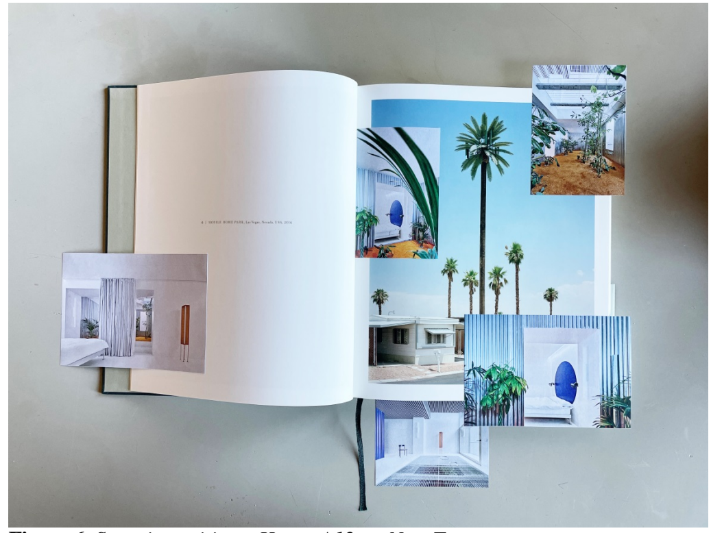
Figure 6. Superimpositions. House A12 on New Trees

Among these project, detailed analysis should be made of the A12 home project in Madrid by Lucas y Hernández-Gil architects, who propose an approach to the theme of the relationship with nature in the dwelling as a solution capable of rethinking certain spatial problems in the urban environment and as an element enhancing the domestic imagination. The project involves conversion of a commercial space into a residential and office space on two floors covering 380 square metres. The main aims are to increase the amount of light in the spaces, given the building's very dark character, and to increase the number of interior patios, in keeping with the architects' idea of introverted Mediterranean living composed of a succession of rooms with the sky (Figure 6).