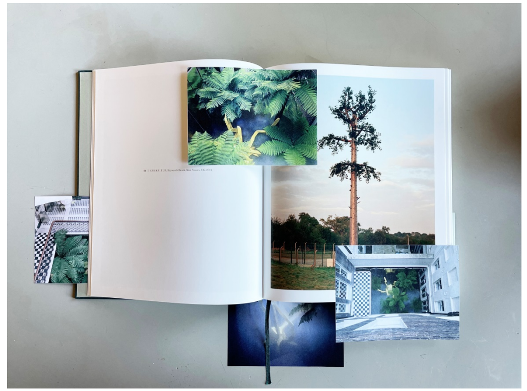
Figure 11. Superimpositions. Sunken Garden on New Trees