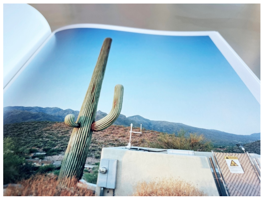
Figure 2. Superimpositions. Robert Voit, New Trees, Scottsdale, Arizona, 2006