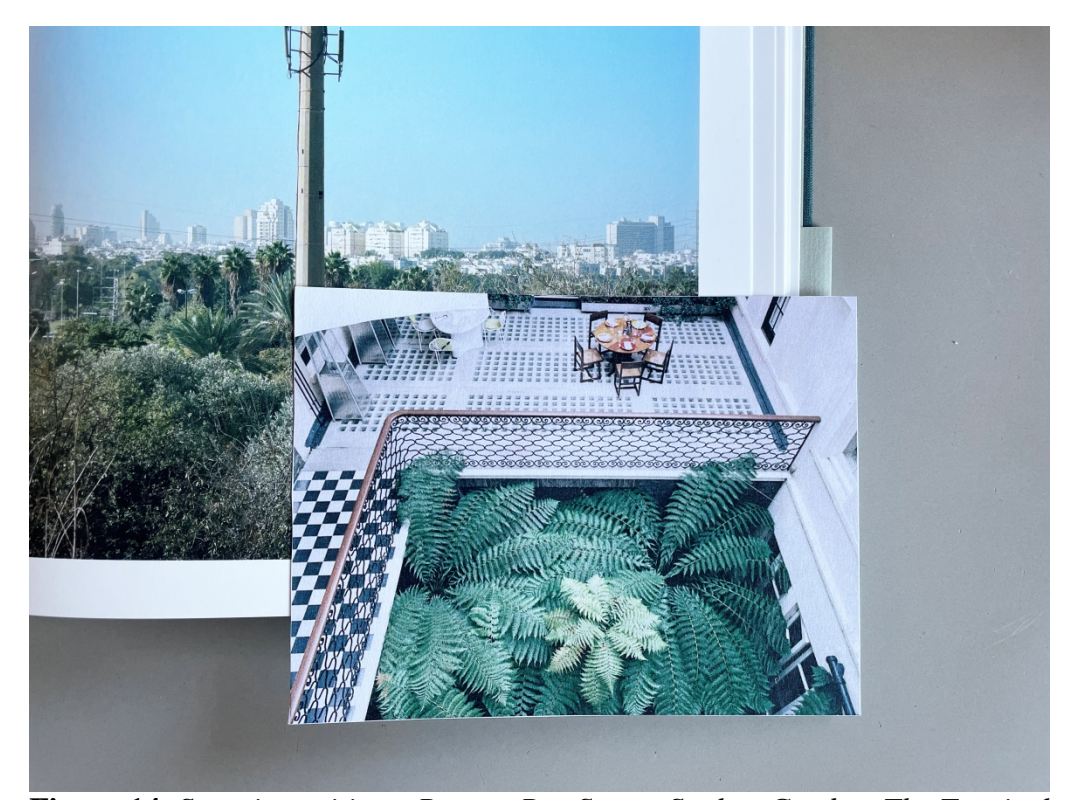
Figure 14. Superimpositions. Bureau Bas Smets, Sunken Garden. The Tropical Vegetation Fills the Few Square Metres of the Courtyard