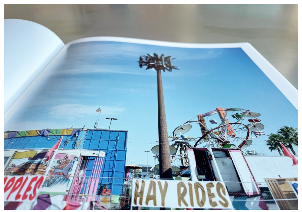
Figure 4. Superimpositions. Robert Voit, New Trees, Galleria at Sunset, Las Vegas, 2009