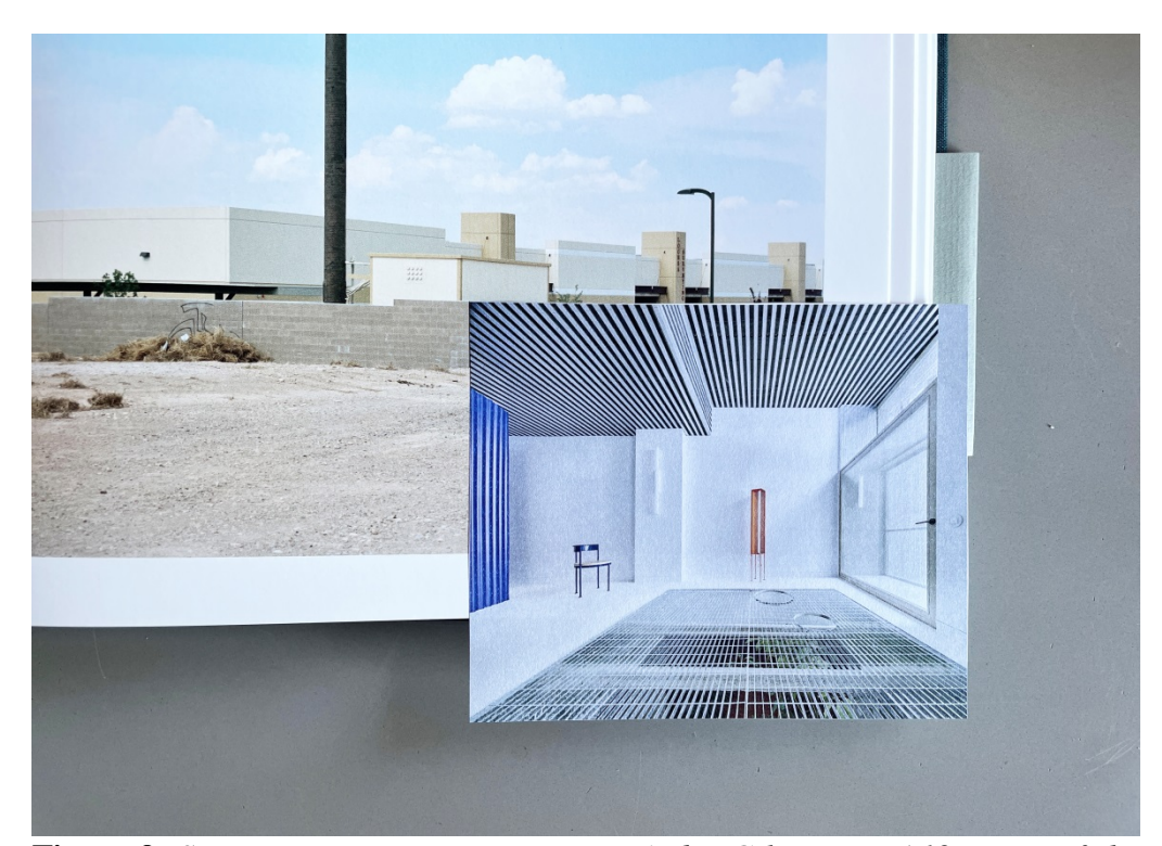
Figure 9. Superimpositions. Lucas y Hernández-Gil, House A12. View of the Garden-Courtyard from the Atrium in the Upper Level