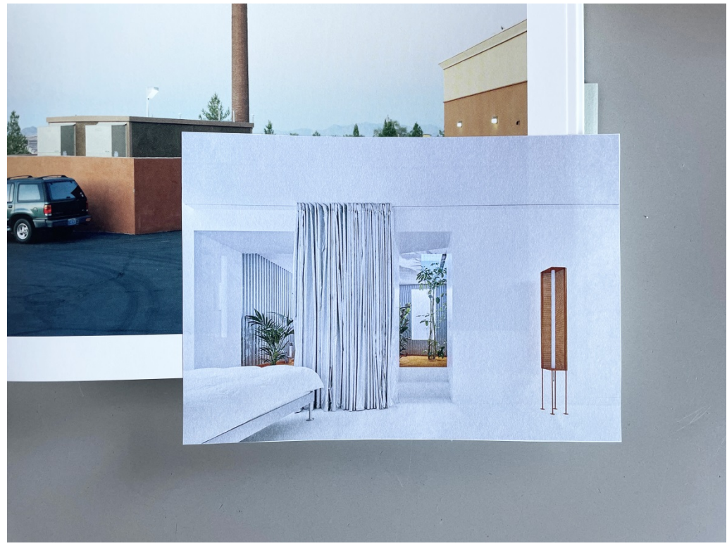
Figure 8. Superimpositions. Lucas y Hernández-Gil, House A12. View of the Garden-Courtyard from the Bedroom