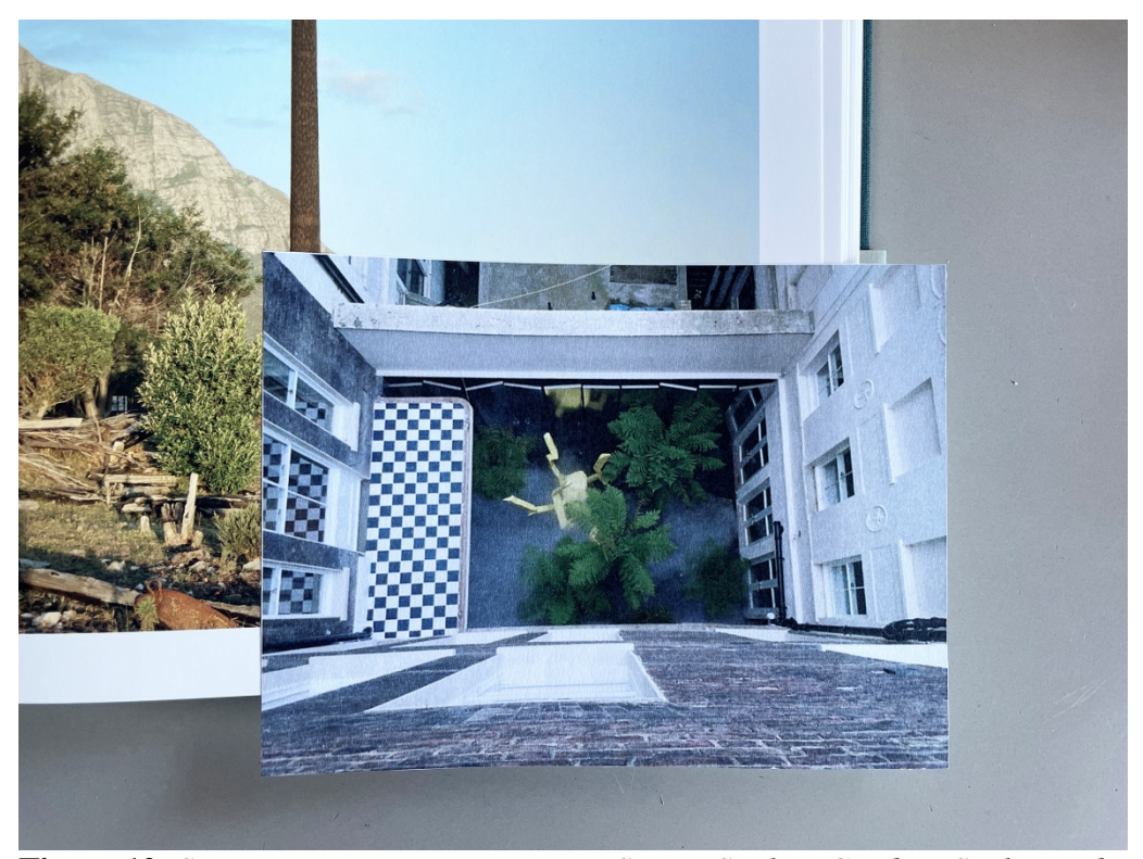
Figure 12. Superimpositions. Bureau Bas Smets, Sunken Garden. Sculpture by Franz West in the Garden