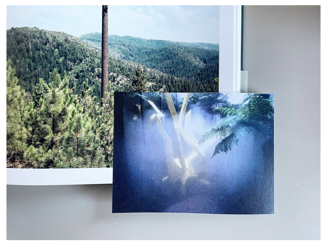
Figure 13. Superimpositions. Bureau Bas Smets, Sunken Garden. View of the Garden from the Buildings

The use of narrative in this intervention defines the possibility of expanding the space beyond its limited dimensional boundaries that would otherwise have defined its claustrophobic and unliveable character. Instead, the definition of the story of the survey of a prehistoric garden within the urban fabric of London allows for the welding together of the best technical and meteorological conditions for the growth of a natural system in the courtyard and for the exploitation of the density of humidity present. At the same time, it allows the space to be enriched by conforming it to a discovery site within an ordinary residential courtyard. The project of the sunken garden makes it very clear how the narration of space is a design tool capable of combining the natural and the artificial and introducing a landscape, perhaps hidden or rediscovered, into the domestic and everyday spaces.