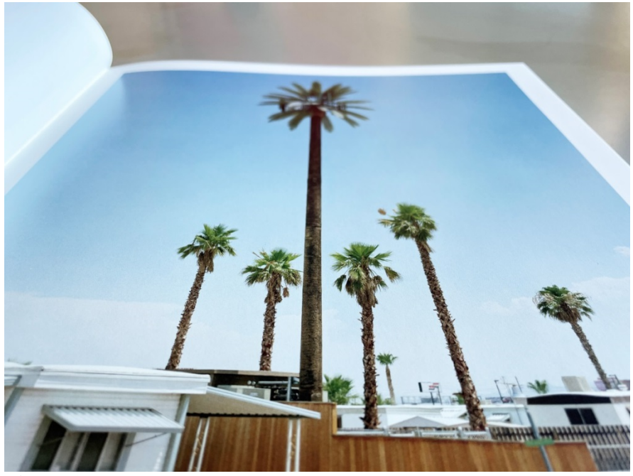
Figure 1. Superimpositions. Robert Voit, New Trees, Mobile Home Park, Las Vegas, 2006

establishes a new relationship of contrast and emulation of the landscape context in which it is inserted, placing the end and means of the project in opposition<sup>14</sup> (Figures 4-5).