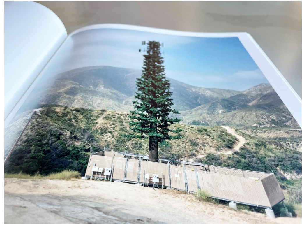
Figure 5. Superimpositions. Robert Voit, New Trees, City Creek Road, Mentone, 2006

It must be acknowledged that the theoretical fortune of the multiplication of vegetation in private urban spaces lies largely in Edouard François's project Tower Flowers<sup>15</sup> which forms the matrix of nowadays insertions of vegetation in terraces and balconies. The project in that case uses nature as an ornament or as a mask of architecture, as Charles Jencks actually stated: "In this way, he creates a postmodern play on 'artificial nature' by taking advantage of the fact that a considerable part of the population, while choosing to live in crowded cities, wishes to return to nature. The contradiction translates into balconies crowded with flower essences that devour the entire house".<sup>16</sup> In the contemporary world, the postmodern game, of which Jencks speaks, is widely used, not only by architects or landscape architects, but also by the actions of individual inhabitants who redesign their balconies, their living rooms or their courtyards through plastic natures or miniatures of forests and botanical gardens. Individual actions of this kind, together with large-scale design proposals, are redesigning the image of the city and contributing to the mixing of landscape and architecture, converging towards ambiguous features that define the image and imagination of our time.