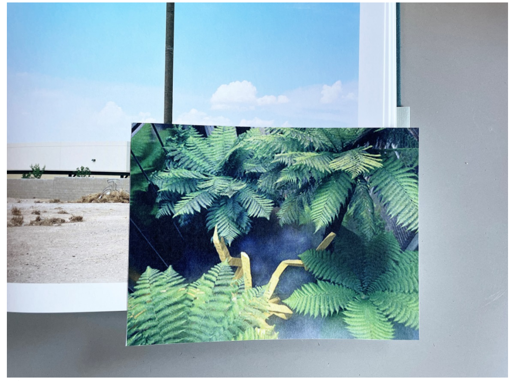
Figure 15. Superimpositions. Bureau Bas Smets, Sunken Garden. Humidification, Mirrors, and the Yellow Inhabitant of the Garden

In the contemporary, it is no longer a question of going to a special place, which, by requiring the crossing of a border and the payment of a ticket, implies a predisposition and an intentionality to go from the ordinary of real contexts to a place that is openly other. This intervention differs from his famous predecessors in that he relies on the operation of transferring a piece of otherness into an everyday place, which is then discovered with surprise and generating a collision of spaces and uses. The collage <sup>23</sup> operation implemented is capable of contaminating different languages and narratives in order to transform a mostly modest place into a space of the imagination.