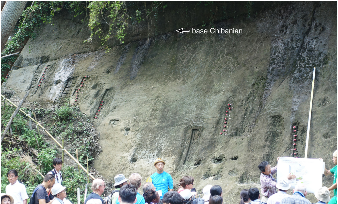
Figure 3. Chiba section, Japan: site of the GSSP for the now ratified Chibanian Stage and Middle Pleistocene Subseries. The marker bed for the GSSP is the Ontake-Byakubi-E (Byk-E) tephra bed (indicated by an arrow) which is 1.1 m below the directional midpoint of the Matuyama–Brunhes paleomagnetic boundary. This reversal serves as the primary guide to the Lower–Middle Pleistocene boundary, allowing its global recognition. Photograph by MJH taken at the INQUA Post-Congress field trip, August 2015.