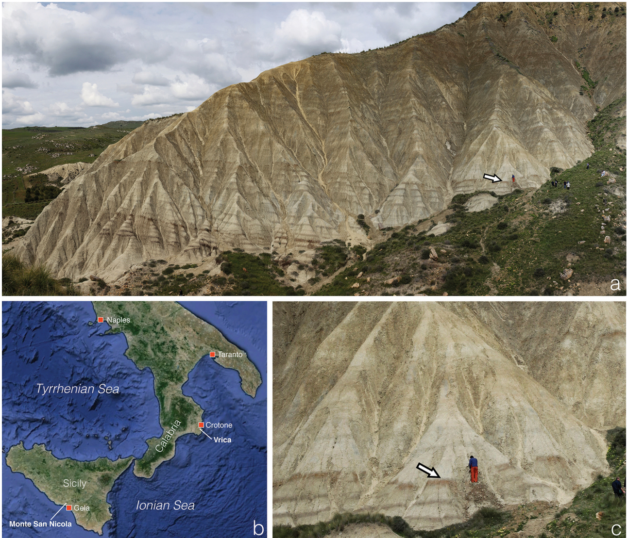
Figure 2. GSSP for the Gelasian Stage, Pleistocene Series, Quaternary System, and the newly ratified Lower Pleistocene Subseries. Panorama (a) and detail (c) of the Monte San Nicola section, showing the level of the GSSP (marked by an arrow) which is placed at the base of a marly layer overlying the prominent, sapropelic Nicola bed. The location of Monte San Nicola (b) is also given.

ent with a U-Pb zircon age of 772.7 \pm 7.2 ka for the eruption/deposition age of the Byk-E tephra (Suganuma et al., 2015).