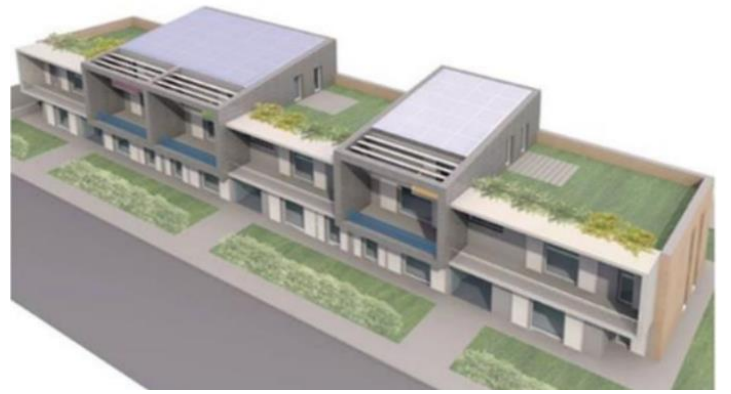
Figure 2. Rendering of the studied building.

The studied building is divided into twelve apartments; it is characterized by a compact shape with balconies aligned along the south facade and a flat roof, except for the area occupied by the duplex apartments (Fig. 2). Moreover, it is divided into an underground level and three levels above ground. The ground floor is employed as private garages and technical rooms, while the other parts of the building are for residential use only. There are six apartments on the ground floor and six on the first floor, with surfaces ranging from 71 m<sup>2</sup> to 95 m<sup>2</sup>. The roof garden is properly insulated, and the duplex roof was designed to hold solar thermal and photovoltaic collectors.