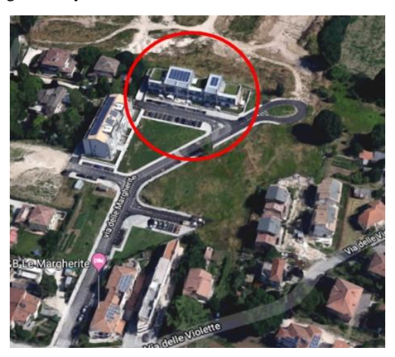
Figure 1. Bird view of the studied building.

Recante Norme per La Progettazione, l'installazione, l'esercizio e La Manutenzione Degli Impianti Termici Degli Edifici Ai Fini Del Contenimento Dei Consumi Di Energia, in Attuazione Dell'art. 4, Comma 4, Della Legge 9 Genna, 1993), in the Umbria region, Italy.