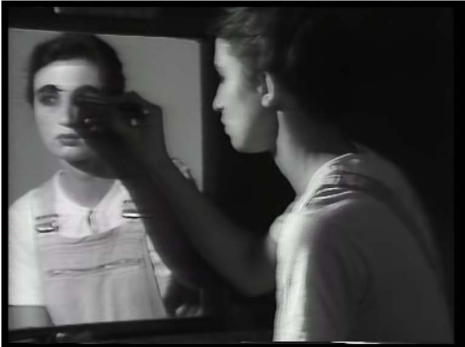
Figure 5. Elaine Shemilt, Doppelgänger , 1979-81, still from video.

The re-enactment was based on the collection and reassessment of documentation and oral recollections gathered through a number of semi-structured interviews with the artist—drawn from the questionnaire employed as research method in EWVA—and further information that emerged during the rehearsals when the artist's memory was stimulated by re-enacting the performance, the medium and further curatorial conversations.