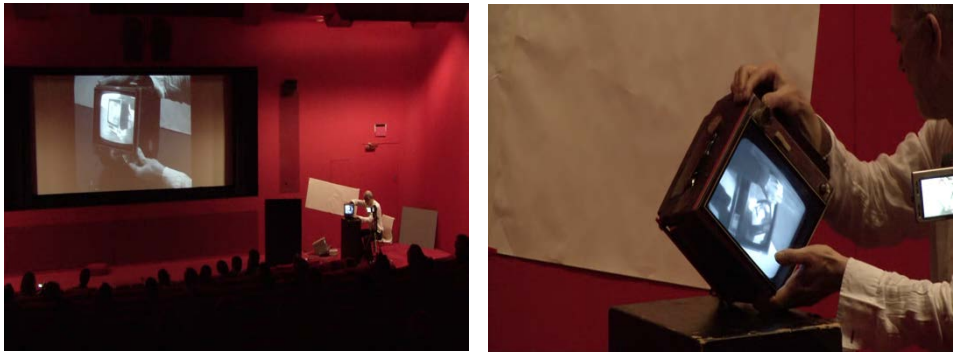
Figures 6-7. Stephen Partridge, Monitor Live! , 2009. ©Stephen Partridge

Like in Doppelgänger Redux , the audience was shown the performance in a big projection that allowed exploring the work more closely. The colours of the live performance that clashed with the images on the monitor in black and white and the aged hands of the artist mark the passage of time.