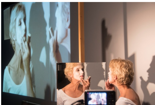
Figures 3-4. Elaine Shemilt, Doppelgänger Redux , 2016.