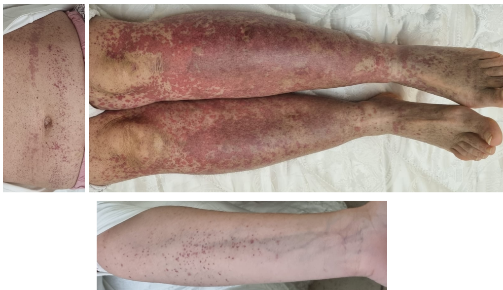
Supplementary Fig. 1. Representative images of diffuse purpura occurring 1 day after the 2 nd dose of Pfizer/BioNTech vaccine (patient n. 2 in Table 1 of the main text). The digital images have been produced by the patient 4 days after the onset of flare.