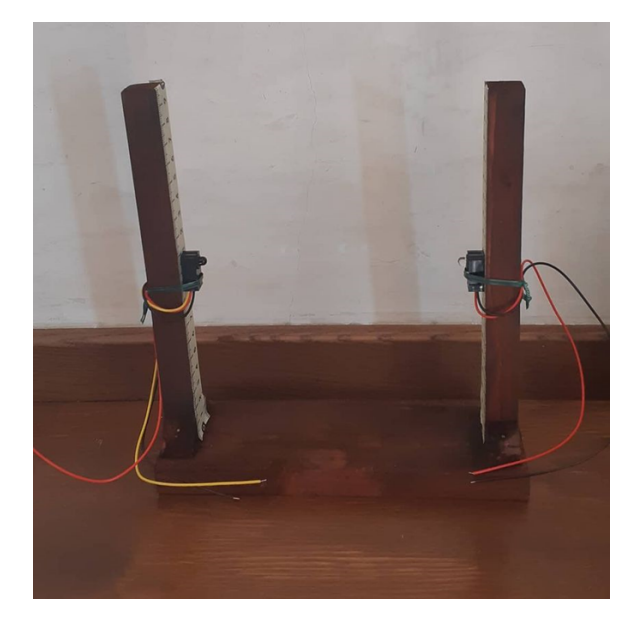
Figure 2: U-shape support for IR pair sensors.

The electromagnet, the button and the IR sensors are connected to Arduino board by its digital pins. The overall setup is connected to the computer for data acquisition by the USB cable.