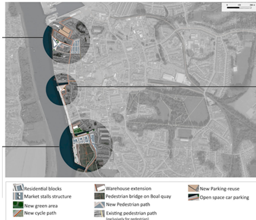
Fig. 3. masterplan (detail)

The final proposal for the Masterplan can be seen in Fig. 3. The Masterplan focuses on urban design solutions based on resilience related to adaptation to scarcity of resources and mitigation risks, the improvement of the flexibility of uses in public spaces (Un, 2015), and the enhancement of historic urban landscape (Unesco, 2011).