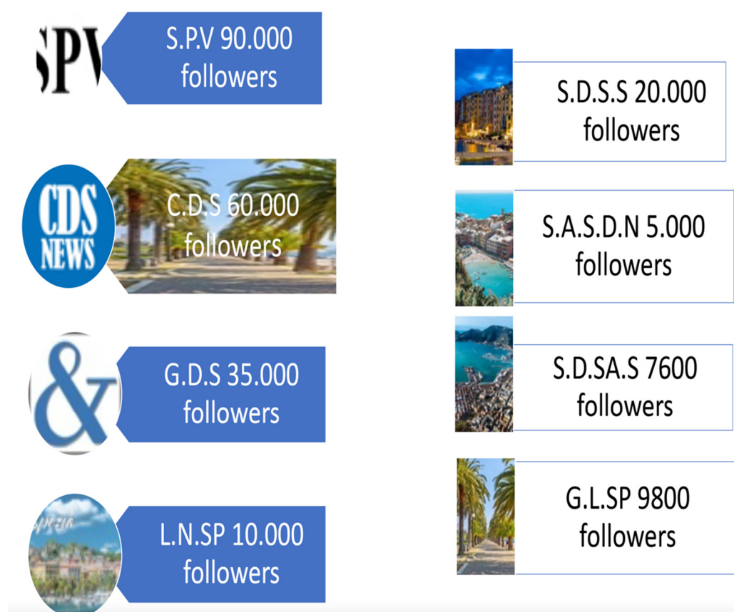
Figure 1. Facebook pages and groups analyzed in this research.

To select our population, we searched the mentioned Facebook pages/groups using the keywords “doctor,” “nurse,” “assault” and “hospital” to collect only posts referring to the NHS. In this case, posts not referring to a sanitary context were excluded (e.g., female assault, violence against other workers). Later, starting from the selected posts, we manually conducted a descriptive analysis of every comment using a reasoned choice sampling. We classified every comment in a binary way (negative or not negative). The classification was made using the following criteria: