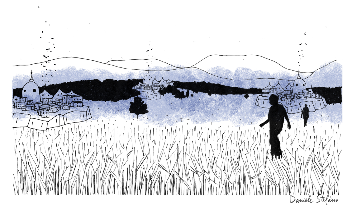
Fig. 5 –Daniele Stefàno, Eutropia, Illustrazione de Le Città Invisibili di Italo Calvino