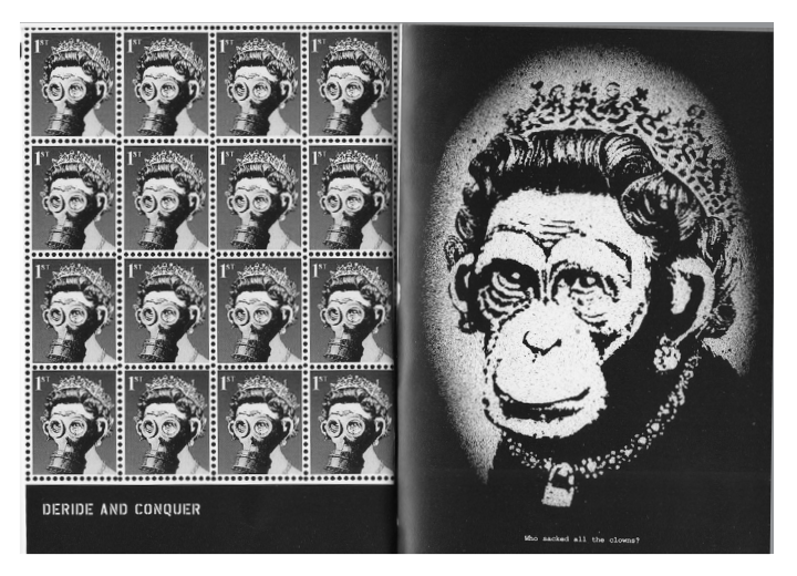
Fig. 2 Banksy, Deride & Conquer / Who sacked all the clowns? (Banksy, 2001, pp. 46, 47).

Banksy in 2004 was not yet the millionaire artist he is today. He had just a couple of personal exhibitions under his belt, but he was slowly building a solid credibility and an aura of mystery that will make his fortune. In 2003 he performed one of his first stunts, which consisted in attacking one of his framed works inside a museum. He pasted a painting inside the Tate Gallery, complete with a plate with a caption without being seen. It was only noticed when the glue no longer held and the painting fell to the ground. By the time he makes the Tenner, Banksy is therefore in the mood for jokes. He prints 1 million pounds in £10 notes. Presumably offset lithograph printing on double-sided sheets that collect two columns of five banknotes, then he cuts out the individual banknotes. Banksy's goal is to open a briefcase full of money in a very crowded place, making the money fly in the air and creating confusion among the people. Banksy selects two particularly well-known and crowded events in the London area, the Reading Festival and the Notting Hill Carnival. They are two events close to each other, the first from August 27 to the 29 and the second from 29 to 30. The prank would have been remembered and reported in the news, but there is no trace of it. The reason is simple: it never happened. In a 2016 video