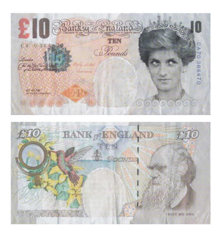
Fig. 1 Banksy, Di-Faced Tenner , 2004, offset lithograph print, 7.62 x 14.61 cm.

In 2004, the English artist Banksy produced a particularly interesting artwork: a fake 10 Pounds banknote<sup>1</sup>. Instead of Queen Elizabeth, he inserted the face of a character of English history that is opposite to the regnant: Lady Diana (Figure 1). The counterfeit banknote takes the name of Di-Faced Tenner , to recall both the 'Di' of Lady Di and the term defaced. But the changes to the original do not end here, instead of Bank of England the artist wrote Banksy of England. The sentence below, in the original "I promise to pay the bearer on demand the sum of" becomes "I promise to pay the bearer on demand the ultimate price" recalling the tragic end of the Princess of Wales. The back, on the other hand, apparently remains unchanged, with the face of Charles Darwin. But if we give a closer look, it is possible to notice a small writing in the lower right that says "Trust No One". It can be said that this work is an evolution of the disfigurement of the queen's image, which had already occurred a few years earlier when