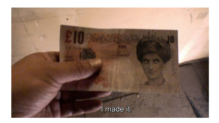
Fig. 3 Banksy, Exit Through The GiftShop, 2010, movie still.

In saying this, he suggests to the viewer that the reason why he did not perform his prank is for fear of being investigated for money counterfeiting<sup>2</sup>. It is definitely a severe