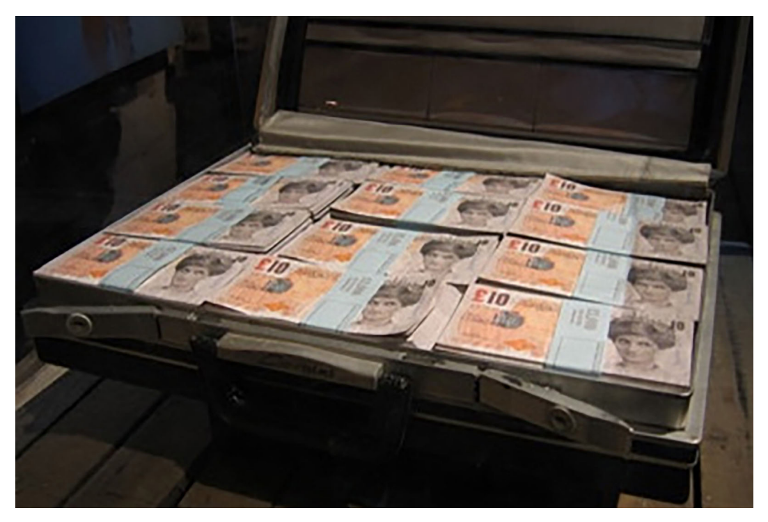
Fig. 6 Banksy, Suitcase with Di-Faced Tenners, from the Exhibition Santa's Ghetto 4 (2004). Retrieved March 23, 2021 from https://banksyunofficial. com/2017/04/17/santas-ghetto-04-london-december-2004/.

Fig. 7 Banksy, Di-Faced Tenners , Offset lithograph printed in colours on both sides of the sheet, signed in black pen, 450 by 315mm 17¾ by 12¾in. Retrieved March 23, 2021 from https:// www.sothebys.com/en/buy/ auction/2020/banksy-online/ banksy-di-faced-tenners.