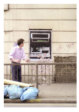
Fig. 5 Banksy, Cashpoint with Di-Faced Tenners (Banksy, 2005, p. 97).

Di-Faced Tenner also appears in his latest official books, Cut It Out and Wall and Piece. In the first, there is a simple doublepage image of a wrinkled tenner with the caption "It's going" to take one very special lady, or a whole load of average ones, to get over you" (Figure 4). In the second, it appears twice. First, as a paste-up inside a stencil made in Farringdon (London) in 2005 where an ATM makes several banknotes fly out of its mouth (Figure 5). Secondly, as part of a single sheet of banknotes ready to be cut. In addition, in his 2004 exhibition, Santa's Ghetto, a briefcase containing several wads of tenners appears, as if to recall the Liverpool Station prank that never took place (Figure 6). It does not appear that single banknotes have ever been sold. The only Di-Faced Tenner that can be purchased and authenticated is a series of prints that Banksy began to sell as early as 2007. The prints do not depict a single banknote but a sheet ready to be cut, therefore two columns of five banknotes with Lady D on the right