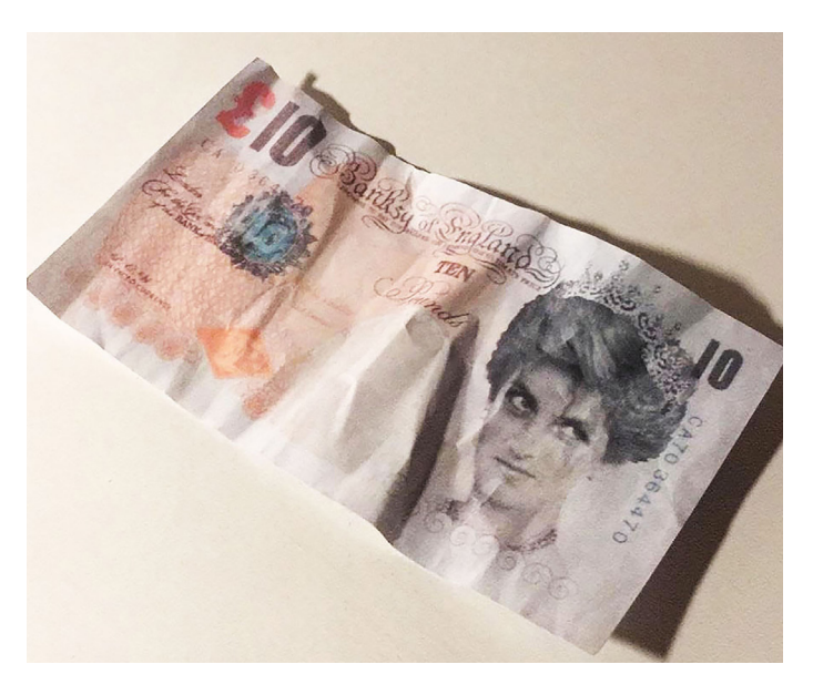
Fig. 11 X Y (after Banksy), Home printed Di-Faced Tenner , Digital print, 7.62 x 14.61 cm.

2 The MOCO catalogue on Banksy confirms this theory.