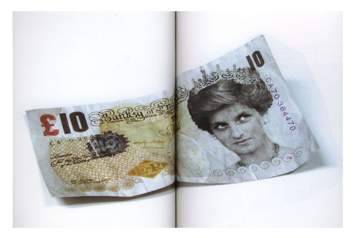
Fig. 4 Banksy, Di-Faced Tenner (Banksy, 2004, pp. 62, 63).

charge, which becomes almost a contradiction if you think of the aura of illegality that surrounds the street artist. The fact is this: in the end, Banksy does not perform any of the stunts mentioned above; therefore, the only original Di-Faced Tenner are those hundreds of banknotes that the artist circulated during a handful of evenings in August 2004. All the others are crammed inside boxes, as Banksy himself shows during the documentary.