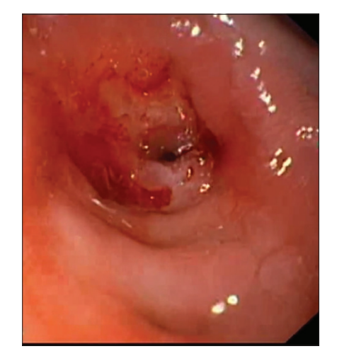
Figure 4 Gastric bypass: stenosis at gastrojejunal anastomosis