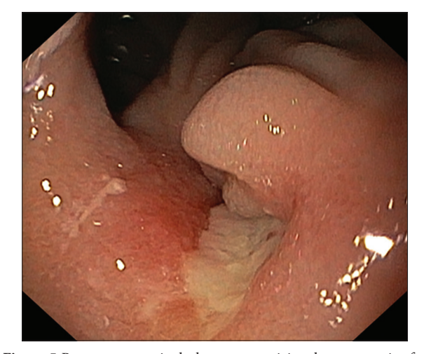
Figure 5 Recurrent marginal ulcer at gastrojejunal anastomosis after fibrin healing