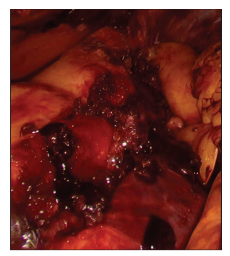
Figure 2 Sleeve gastrectomy: staple-line bleeding. Re-laparoscopy

A long stapler line is mostly responsible for postoperative bleeding in 0-20% cases, with a re-operation rate of 1.4% for major bleeding [20] (Fig. 2), while intraluminal bleeding is uncommon. Modifiable factors should be investigated and corrected before surgery. Comorbidities, such as liver disease (non-alcoholic fatty liver), coagulopathy, hypertension and super-obesity, increase the bleeding risk and should be carefully evaluated and treated preoperatively when possible [21,22]. Patients who are candidates for SG as a revisional procedure, mainly after adjustable gastric band