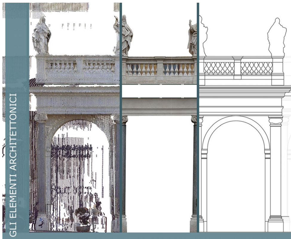
Figure 4. Architectural interpretation: the portico of church of Santa Maria in Trastevere. From left to right: numeric model derived from laser scanner 3D data capture, 2D ortho image extracted from structure-from-motion numeric model, and 2D geometric representation of the main construction lines from architectural reading of the portico.

Even though this distinction highlights differences in the documentation approach used for heterogeneous elements, the process presented here demonstrates the added benefit of using a level of computational power that does not impose practical limits on data capture. For the analysis of the artifact from an architectural and compositional point of view, the reading of the detail and of the chromatic features of surfaces plays an important role. The nature of the documentation project – defined by a strategy that fits the objectives of the research – determines the methods and tools for data capture and data processing. In this case, the process is not linked to limits imposed on the number of images (and the level of resolution) that can be acquired. This makes it possible to obtain three-dimensional numerical models, with high point density, that better enables the user to “experience” the object. These models play a fundamental role in the documentation of the object as well as the dissemination of digital data (Fig. 4). The numerical model, meant as a product of a scientifically reproducible process, is well suited to sharing and implementation among researchers in all fields connected to the investigation of the object. The organization of a digital database open to users with different levels of specific knowledge about the object would allow continued systematic documentation would provide analytical tools for scientific research [Apollonio et al. 2018].