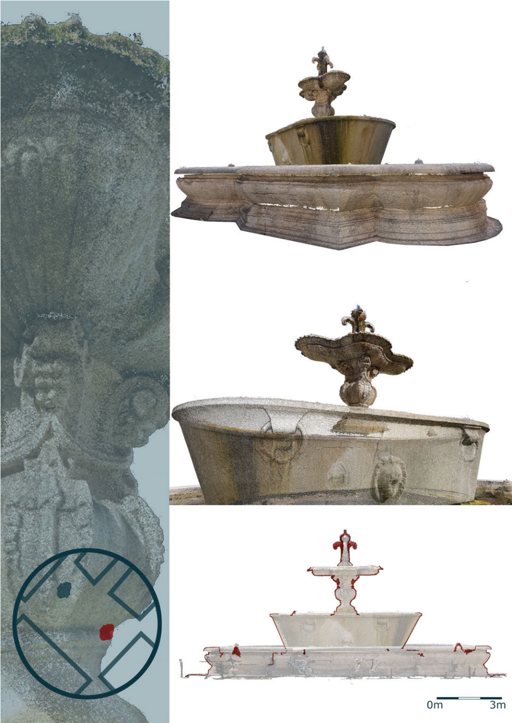
Figure 6. Southeast fountain, Piazza Farnese.