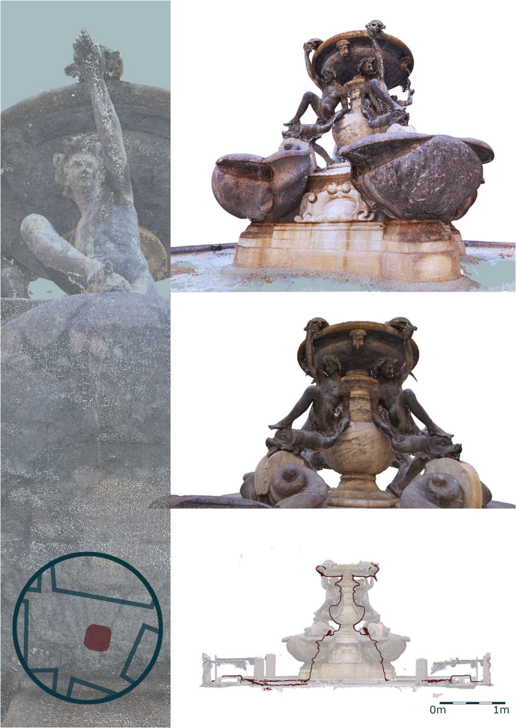
Figure 5. Fountain of the Turtles, Piazza Mattei.