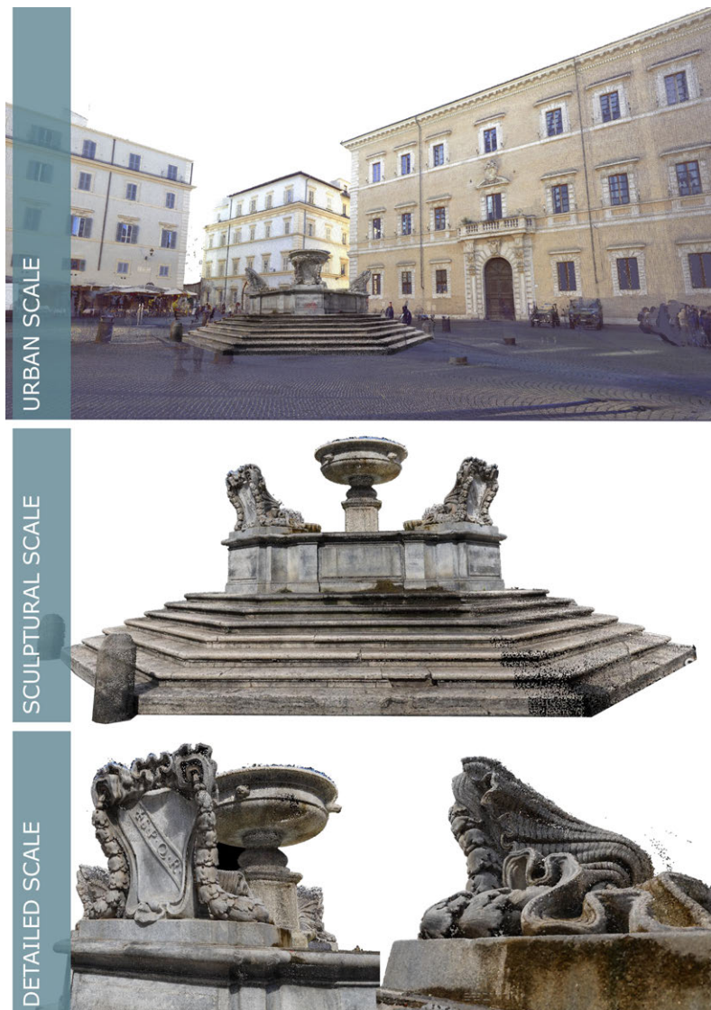
Figure 3. The scale of survey, integrated data capture.

A primary consideration is the scale of the selected object. In the case of the fountains, the SfM process is more controllable and, to a certain extent, independent from other data capture techniques (making integration with other modalities not always essential). The opposite is true with respect to architectural and urban scales, where it is considered necessary to integrate different data capture methodologies (including survey) to achieve metric and geometric accuracies and to accommodate heterogeneous data gathered from different sources. Finally, on the diametrically opposite side, is the detailed relief of objects with dimensions on the centimeter scale. In this case the acquisition strategy cannot ignore the use of pre-arranged instrumentation and photographic settings, the effectiveness of which strongly determine or condition the obtained result (Fig. 3).