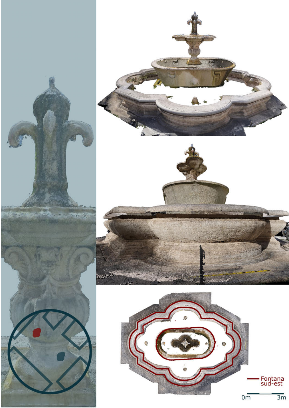
Figure 7. Northwest Fountain, Piazza Farnese.