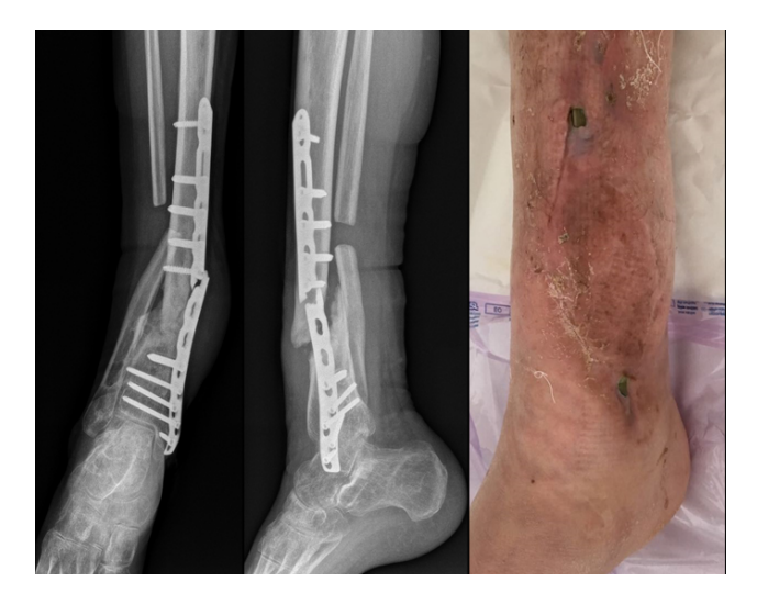
Figure 2. Radiographs and clinical pictures upon admission, in CFRI case report.