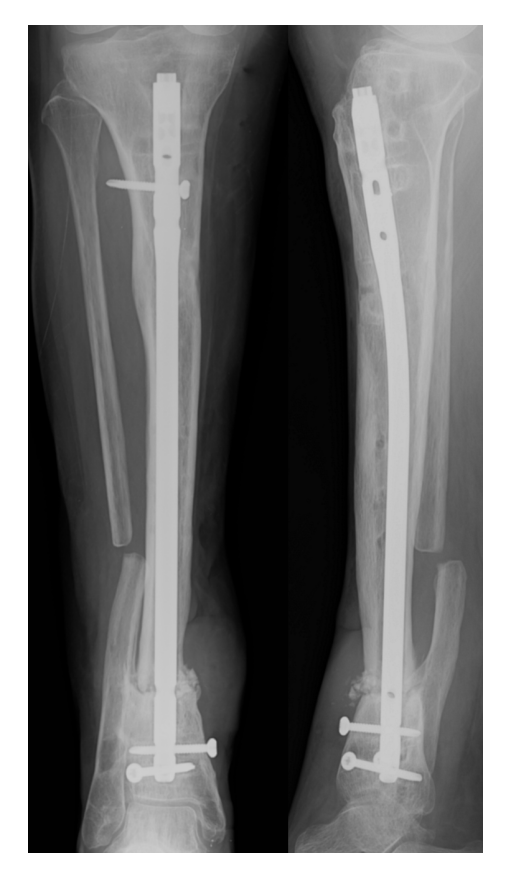
Figure 4. Follow-up X-ray after nail dynamization, in CFRI case report. Failed union at distal tibia with an osteolytic bone cyst in tibia, sclerotic lines around the distal screws.

insidious and heterogeneous onset. As a matter of fact, main Candida hematogenous osteomyelitis manifestations are local pain with confirmatory tenderness, erythema, edema, limitation of functions and movements, draining of pus, or sinus tracts. According to Gamaletsou's review (2012), fever is present only in a small number of patients, the onset is frequently insidious, starting with local symptoms and developing from subacute to chronic course, with a moderate or minimal response of the laboratory inflammation biomarkers.