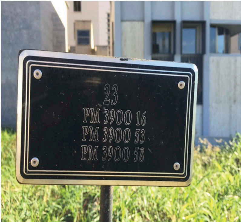
Figure 3. A plaque with the identification numbers of three victims, in the graveyard in Catania, Sicily, indicating that these bodies could not be told apart.

The victims' effects also received ample attention. These personal items would end up in little plastic bags, each with the same identification number as the one on the coffin and the plaque. Many of these items were documents and photographs sewn into clothing. There were little wooden sticks that the victims used for cleaning their teeth, photos of saints, or even a spoonful of dirt wrapped up and brought from the victim's