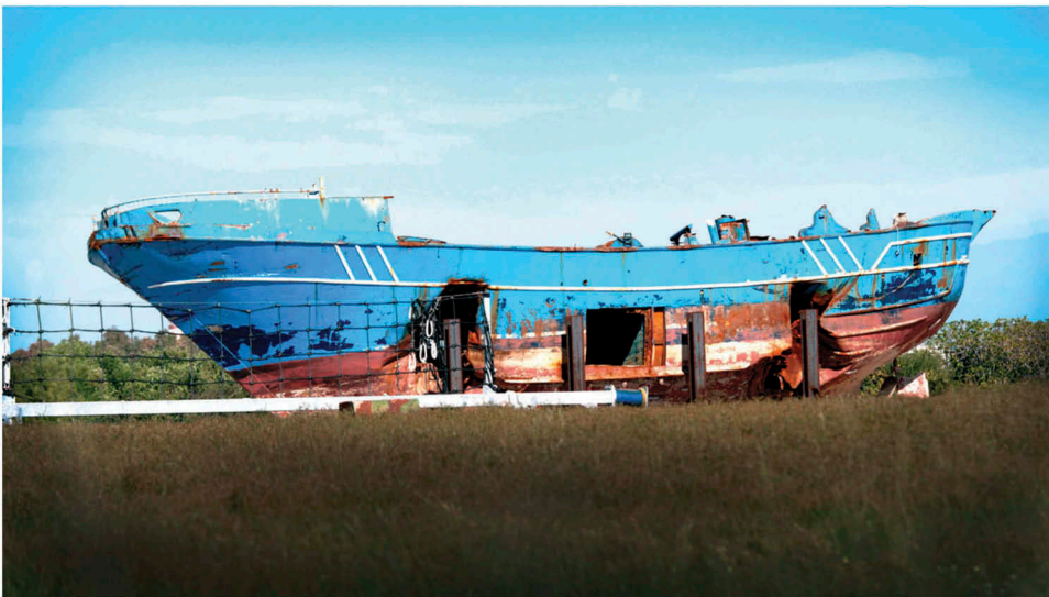
Figure 2. The shipwreck.

Since the bodies had been in water for such a long time, they had gone through a process called saponification, which is the conversion of soft tissue and fat into a soapy whitish layer covering the body. Saponification stops the decay process because it forms adipocere, a substance called 'cadaver wax'. The process of saponification takes a few months, after which the body begins to fragment into pieces. Indeed, many bodies in the cargo had started to fall apart. Using shovels, the firemen collected 457 body bags full of commingled human remains. Five refrigerated trucks provided by the ICRC transported the body bags from the harbour where the wreck was, to a NATO hangar close by. NATO had agreed to host this ambitious project by providing its base in Melilli. Each of these details is not trivial but key to the movement of bodies.