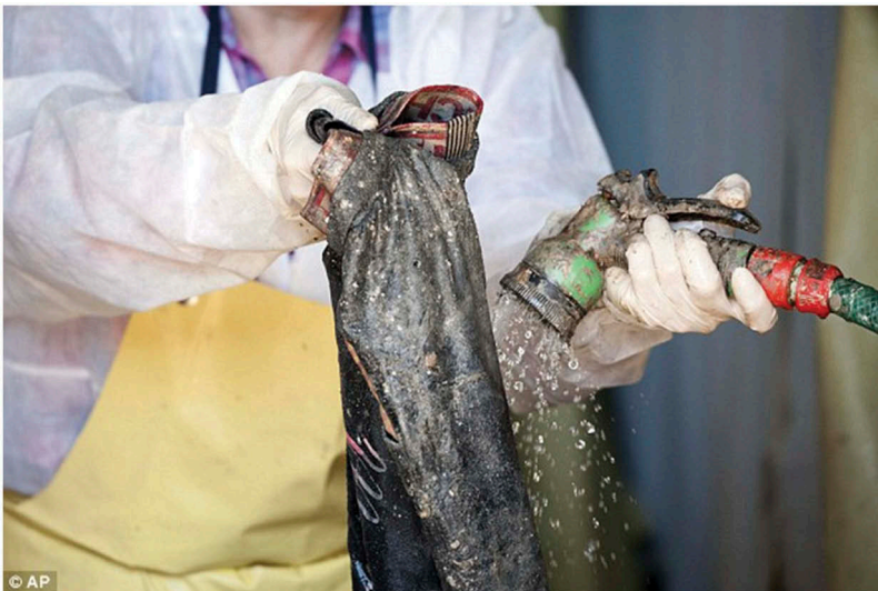
Figure 4. Washing the trousers of a young victim before photographing the label.

On another occasion, one of the forensic anthropologists was annoyed that while cleaning the bodily remains, small bones kept disappearing in the sink. Given that the firefighters had collected 457 body bags, not bodies, a crucial aspect of the forensic examination was counting. One of the aims of the forensic work was to understand how many people were on the boat, and the bones were important traces in this process of counting. As one practitioner explained, 'If I find two R1 [right radius 1] bones in