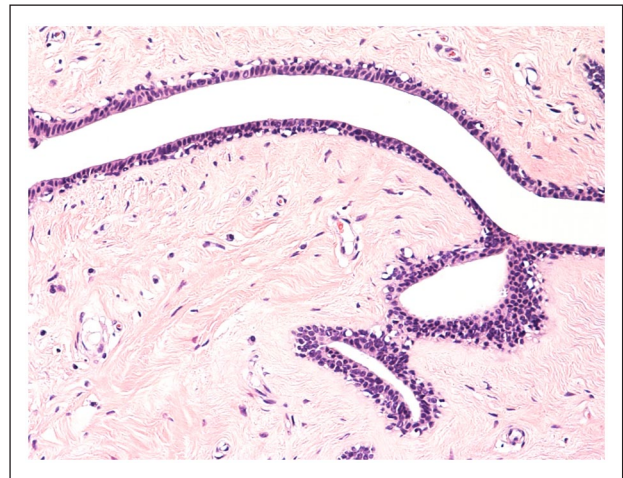
Figure 3. Glands covered by cuboidal/low columnar epithelial cells resting on a myoepithelial cell layer (H&E, ×100).

as other mammary-like gland tumours (e.g. Paget’s disease, lobular intraductal and phyllodes tumours), are found in the anogenital region. 4,5 They are typically found in female patients, but not always, and are more likely to be near the vulva than the anus.