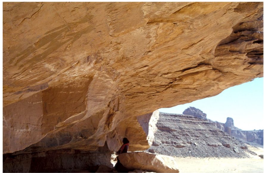
Fig. 9 Round Heads anthropomorphs from Afozzigiar, a rock shelter in southern Acacus

of other places, such as the Messak Settafet and the Messak Mellet, where damage is irreparable. This leads us back to the role of state institutions and other stakeholders involved in the nomination process: Had the Messak been included in the UNESCO World Heritage List in the early 1980s, would it have suffered the same damage? And why was it not included in the first place? It is based on this unfortunate experience in Libya that I have called for the reinsertion of Niola Doa, in the Ennedi Massif in Chad, as a proper UNESCO World Heritage property and not simply