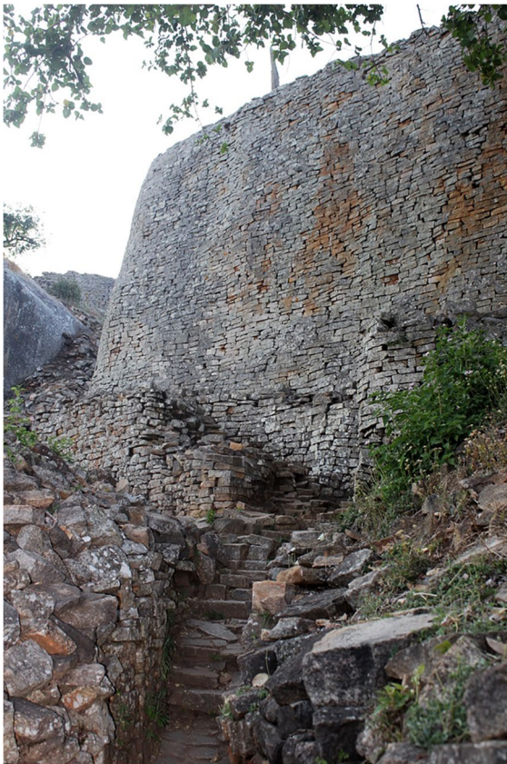
Fig. 4 Great Zimbabwe National Monument in Zimbabwe

Tourism narratives developed by Africans in Africa, ignoring the borders created by the Berlin Conference, have the potential to be transformative (Chirikure, 2020; Esterhuysen et al., 2016; Ogundiran, 2020). This is especially vital given that the African Union (AU) has come up with Agenda 2063— The Africa We Want —an ambitious 50-year continental development plan that pivots on cultural heritage. Building on this, the Office of the UN Under-Secretary-General and Special Adviser on Africa hosted Africa Dialogue Series panel discussions on May 26–28, 2021. The discussions internationalized the African Union's call to use African heritage to transform mindsets, create economic opportunities, and build sustainable communities within the UN system. The hope is that tourism