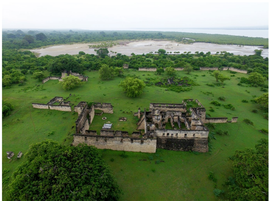
Fig. 11 Aerial view of the Makutani Palace in Kilwa Kisiwani, Tanzania

Additionally, there are shipwreck sites dating from the eighth to the fourteenth centuries. The first one is around Jiwe la Jahazi (“stone of the dhow”), a 3-m high islet on a 38-m long reef crest which looks like it has the bow and stern of a boat from a distance (Pollard et al., 2016, pp. 357–359). Intertidal surveys conducted around Jiwe la jahazi have recorded a number of basalt blocks, large sandstone cobbles and boulders, and a number of ceramics imported from the Persian Gulf. These materials suggest that a vessel carrying imported goods from the Gulf wrecked at Jiwe la Jahazi between the eighth and tenth centuries