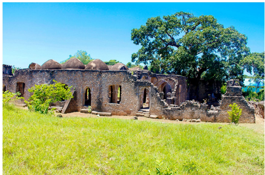
Fig. 10 The Great Mosque of Kilwa Kisiwani, Tanzania

The ruins of KK are a part of UNESCO's World Heritage Sites along the southern coast of Tanzania. In the late 1930s, the British colonial government in Tanganyika (now Tanzania Mainland) declared these ruins national monuments based on the provisions of the Monument Preservation Ordinance of 1937 (Ichumbaki, 2016). After independence in 1964, the ruins were protected under the Antiquities Act of 1964, which was amended in 1979. Later, UNESCO inscribed the KK ruins together with those of a nearby island of Songo Mnara on the World Heritage List in 1981. Together, these islands provide exceptional architectural, archaeological, and documentary evidence for the growth of Swahili culture and commerce along the East African coast from the ninth to the nineteenth centuries. The ruins of KK represent visible and tangible evidence of Swahili civilization and bear unique testimony to the expansion of Swahili coastal culture. The Great Mosques (Fig. 10), for example, signify the introduction of Islam to the region during the late first millennium AD. Abundant cultural objects, such as imported ceramics and glass beads, indicate the prosperity of KK during the medieval period. The authenticity and integrity of KK