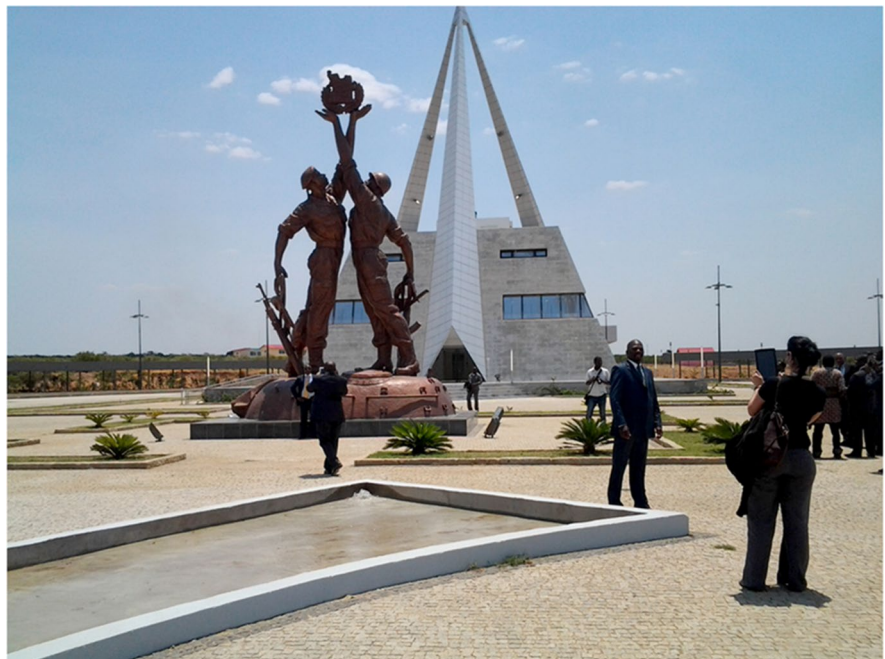
Fig. 5 Cuito Cuanavale Memorial in Angola

For many newly independent African countries in the early 1970s, the idea of acceding to any UNESCO convention was a matter of political recognition. So, signing the World Heritage Convention had little to