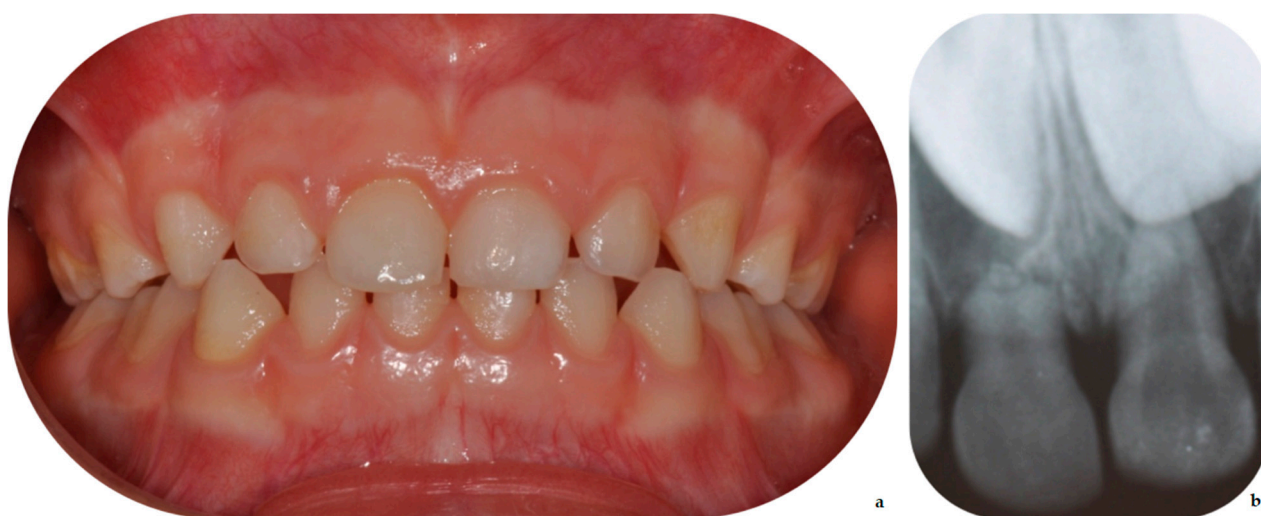
Figure 3. Good healing of the traumatized tooth and supporting tissues (a); in the radiograph (b) early signs leading to PCO and resorption of the radicular fragment.

At the 1-year follow-up appointment, the deciduous tooth showed no sensitivity to percussion nor pulp alterations. Tooth-supporting soft tissue was intact, and no pain or discomfort was reported. The crown showed no signs of alteration in color (Figure 3a). An anterior periapical radiograph was taken, and early signs leading to pulp canal obliteration (PCO) were present; PCO often occurs after dental injuries and can be associated or not with crown discoloration. No signs of pulp necrosis were present. Another aspect that can be observed in the periapical radiograph (Figure 3b) is the atypical resorption of the apical fragment, where—even if different from the physiological one—its characteristics are also different from pathologic root resorption.