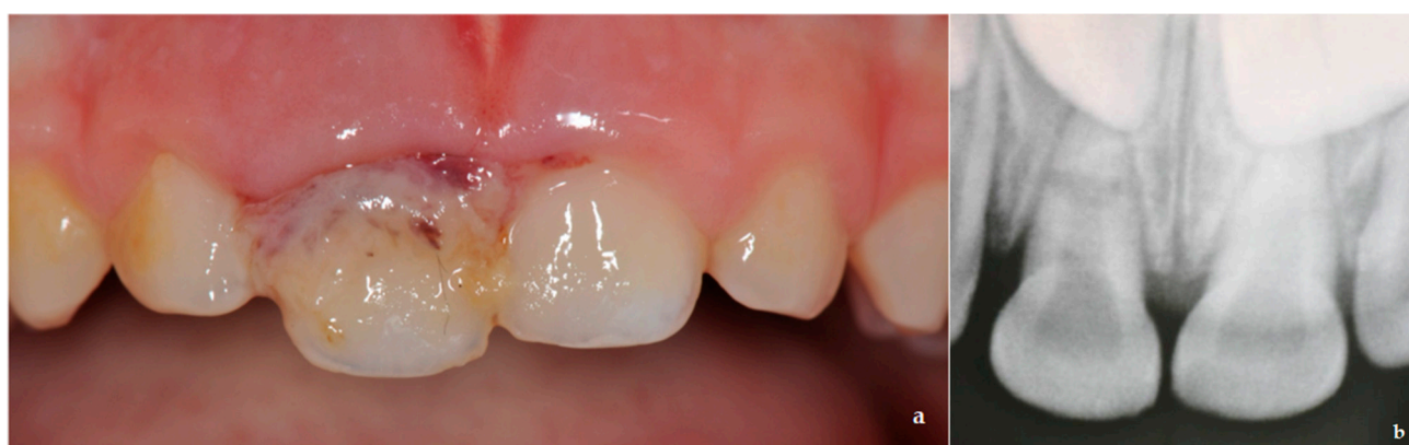
Figure 1. (a) Soft tissue lacerations with hematoma and a displacement of 3 mm along the axis of the deciduous maxillary right central incisor (5.1) were observed during intraoral examination; (b) periapical radiograph showed root fracture and absence of periodontal ligament (PDL) space alteration.

A 3.5-year-old boy with no relevant medical history was referred to the Pediatric Dentistry Unit of Policlinico Umberto I of Rome. Parents reported that the boy suffered a dental injury from a fall while playing at home. The child did not lose consciousness or vomit after the injury. Once informed consent from his parents was obtained, a medical anamnestic chart was filled, and a clinical exam was performed within 1 h of the trauma. During extraoral examination, no abnormalities of the temporomandibular joint were reported. Soft tissue lacerations with hematoma and a displacement of 3 mm along the axis of the deciduous maxillary right central incisor (5.1) were observed during intraoral examination. These resulted in a diagnosis of extrusion (Figure 1a). Furthermore, occlusal interference due to extrusion of the incisor prevented the molars from a proper occlusion. A periapical radiograph of the anterior teeth did not show altered periodontal ligament space, but horizontal root fracture was diagnosed (Figure 1b).