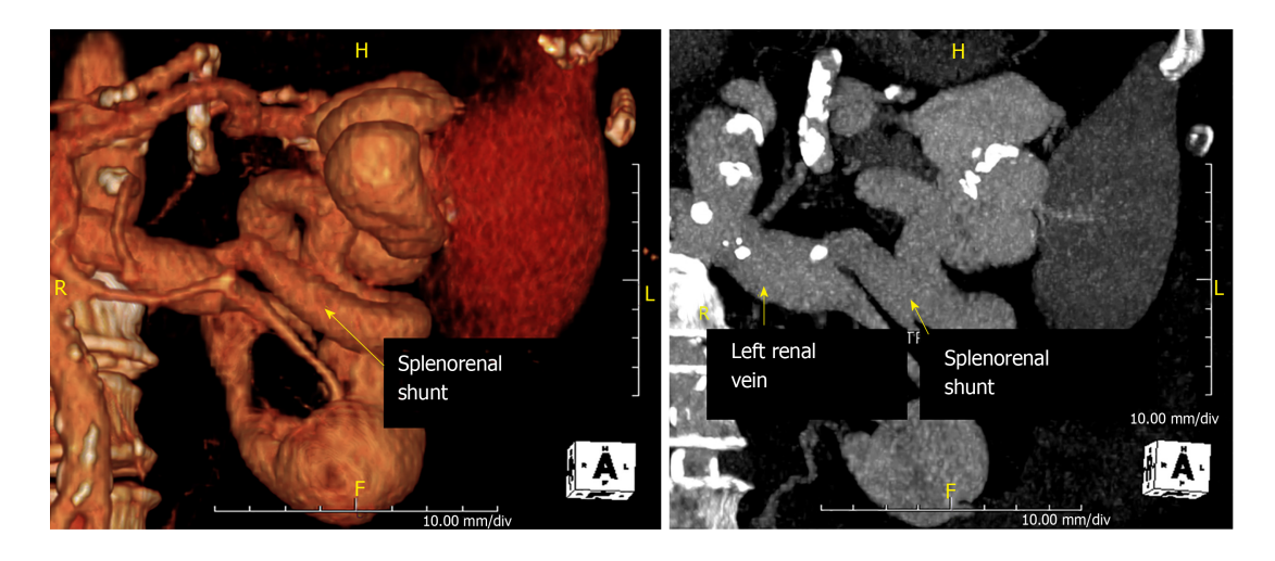
Figure 3 Splenorenal shunt at computed tomography scan.

surveillance and more intensive therapy. Moreover, the identification of SPSS became crucial in selected cases, in which the embolization of large SPSS may be associated with improved survival and liver function, as well as preventing the recurrence of HE or variceal bleeding.