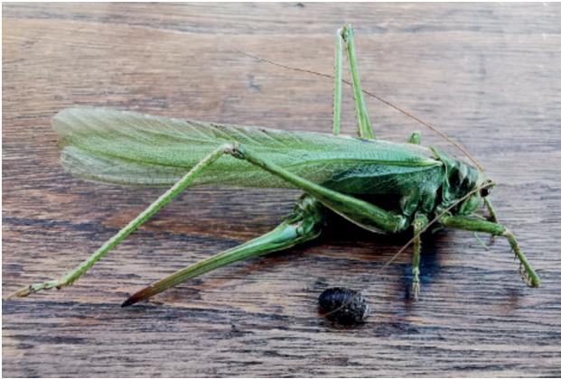
Fig. 1 – The puparium of Therobia leonidei Mesnil, 1964, near the dead host, an adult female of Tettigonia viridissima Linnaeus, 1758.