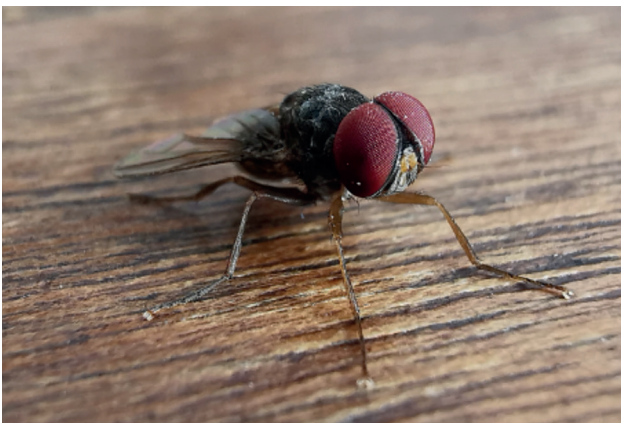
Fig. 2 – Therobia leonidei Mesnil, 1964, adult male.

2017). In Italy, Therobia leonidei has been recorded from the regions of Lombardy, Umbria, Lazio, Sardinia (Cerretti 2001, 2010; Stireman et al. 2012) and Sicily ( https://www.naturamediterraneo.com/forum/topic.asp?TOPIC_ID=156940 ). The host record reported here is the first for Therobia leonidei in Italy (Cerretti & Tschorsnig 2010) and the first report of this species parasitizing the bush-cricket Tettigonia viridissima .