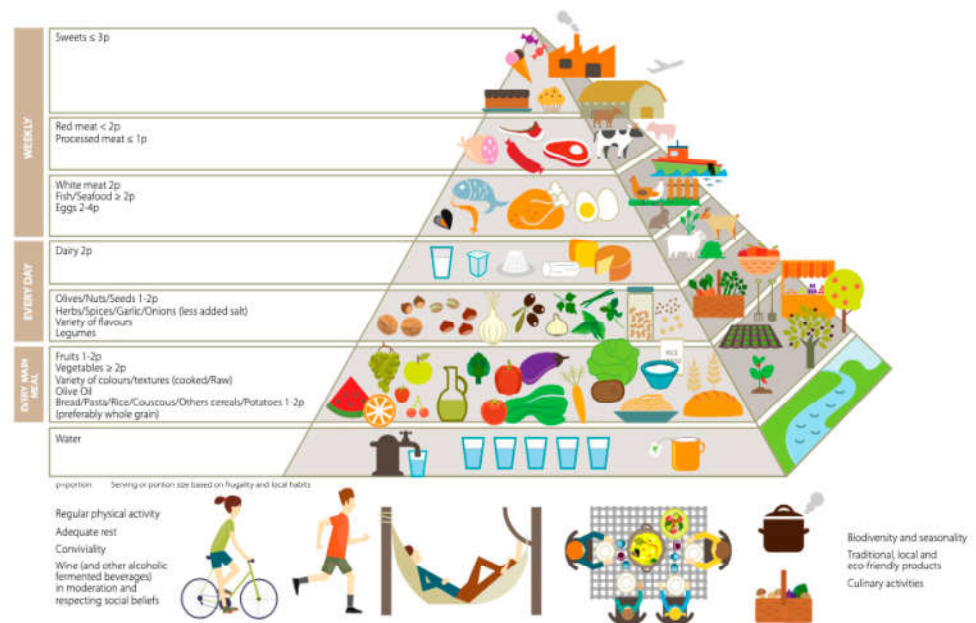
Figure 1. New Pyramid for a Sustainable Mediterranean Diet.

Daily intake of whole grains, fruits and vegetables containing phenolic compounds such as flavonoids and polyphenols, and sources of vitamins, fiber, potassium, magnesium and folic acid, has been shown to reduce human body fatness and the risk of death from stroke, cardiovascular disease, diabetes and cancer [56]. Phytosterols, dietary fiber, and flavones from legumes, following microbiota metabolic transformation and intestinal absorption, produce beneficial effects on cholesterol metabolism and regulate blood pressure and insulin sensitivity, leading to a decrease in mortality risk [56,57,59]. The intake of fish and nuts, which are rich in polyunsaturated fatty acids (PUFA n-3, n-6), such as alpha-linolenic acid, EPA (eicosapentaenoic acid), DHA (docosahexaenoic acid) and linoleic acid, provides lipoprotein metabolism benefits [56,60]. EVOO is the main or exclusive