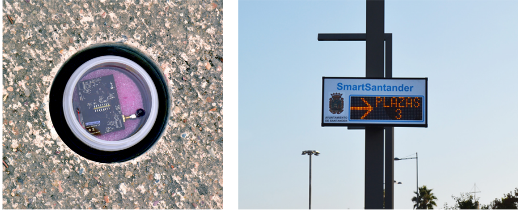
Figure 1: Parking sensors buried under the road surface and Notification Displays to show free parking spots.