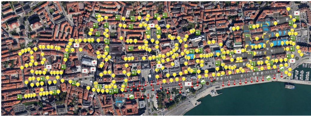
Figure 2: Outdoor deployment of 400 parking sensors and 10 notification panels at the city of Santander