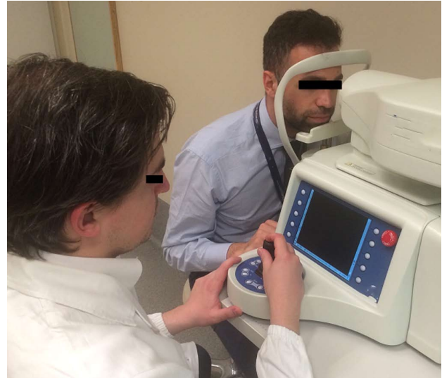
Figure 1 Acquisition of the images with in vivo corneal confocal microscopy. Patient is comfortably seated in front of the machine whilst the operator advances the scanning probe against the cornea with a joystick.

The eye has historically been considered as a pivotal organ for the study of diabetes-related complications. The transparency of the ocular structures has always been used as a diagnostic tool to investigate and actually see in vivo vascular changes in the retina. More recently, increasing attention has been paid to corneal nerve anatomy for the study of human neuropathies. The cornea is provided of the densest innervation within the body receiving nerve fibers from 50-450 sensory trigeminal neurons via the ophthalmic branch of trigeminal nerve [8,9] . These fibers travel above the choroid, reach the limbus where they organize into a nerve plexus [10] . Corneal stromal nerves derive from the limbal plexus and branch into fibers with smaller diameter that establish close connections with keratocytes and corneal epithelial cells [11] . The fibers become denser and smaller in diameter as they reach the corneal apex creating a sub-epithelial dense network in the epithelium, known as sub-basal corneal nerve plexus.