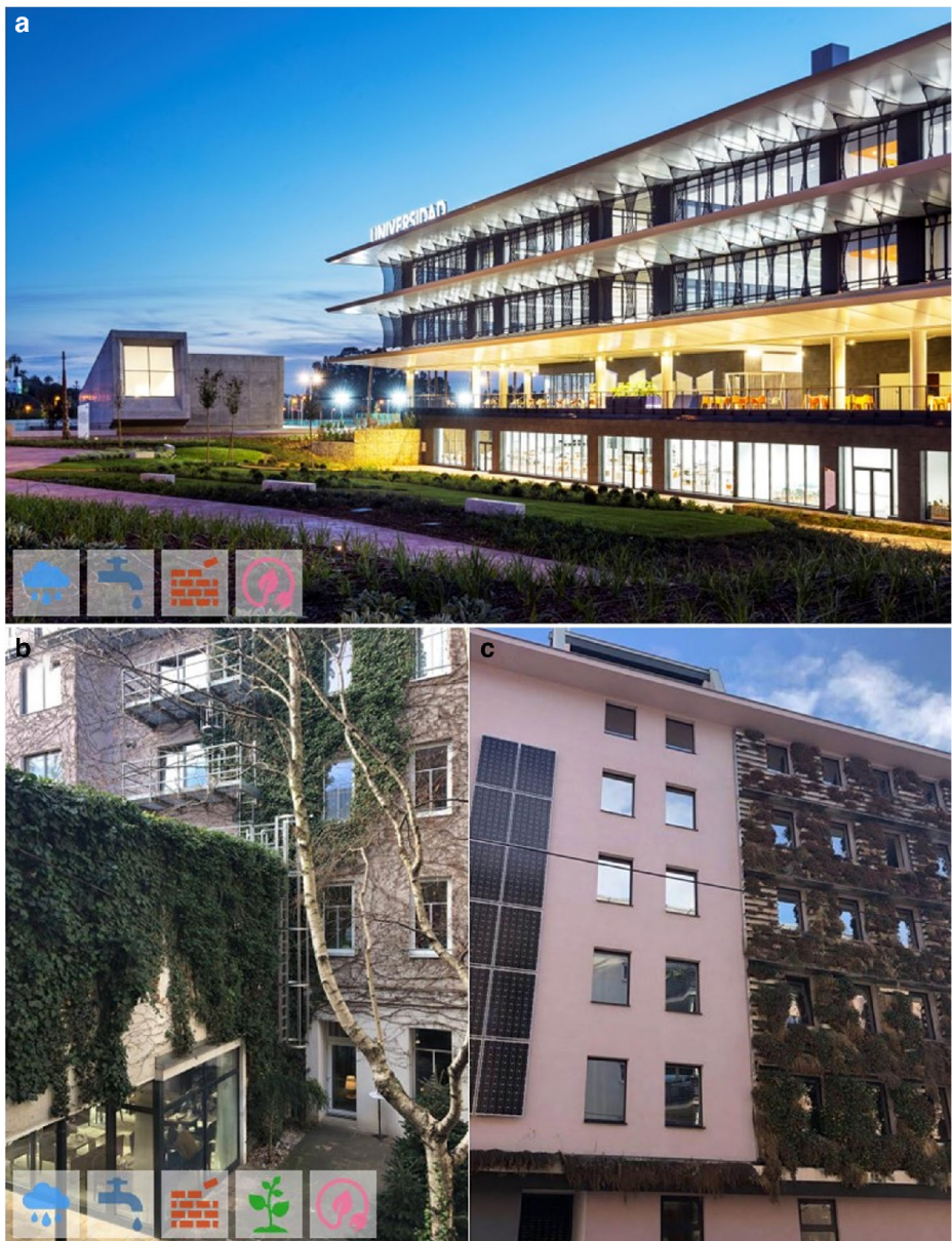
Fig. 2 Implemented cases using nature-based solutions aim to enhance urban circularity challenges: a East façade of the ‘Universidad Loyola Andalucía’ main building at its campus from Seville, Spain; and Boutiquehotel Stadthalle in Vienna, Austria: b interior courtyard garden and c exterior façade with detail of the photovoltaic system and green wall

Construction and Buildings as well as Food, Water, and Nutrients as two additional key product value chains that require circularity actions. Although NBS seem to be relevant for these two key product value chains, the Action Plan lacks any reference to NBS. NBS are reported in the European