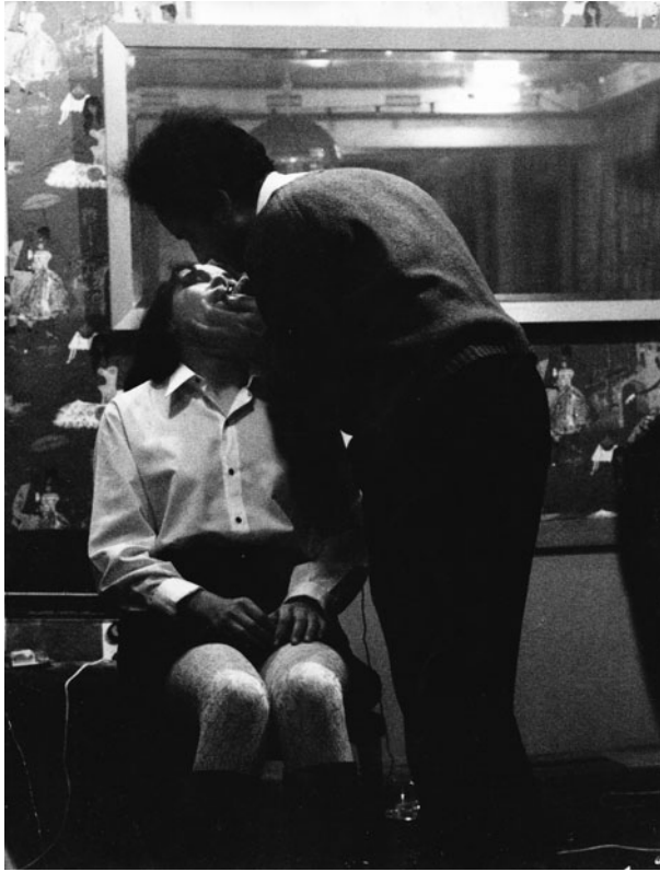
Figure 1. Giuseppe Chiari, Don't trade here , 1968, Berlin (Collection Gianni and Giuseppe Garrera).

for such a celebrated event and definitely unsuitable for staging singing performances, especially if you're looking to create an intimate atmosphere. Of particular interest, in this case, is the fact that Chiari used his voice to utter the sounds of a typically childish word, in that fuzzy area between adult speech and baby language, featuring some analogies with the condition of inferiority staged by Ketty La Rocca in Verbigerazione , which we will talk about shortly.