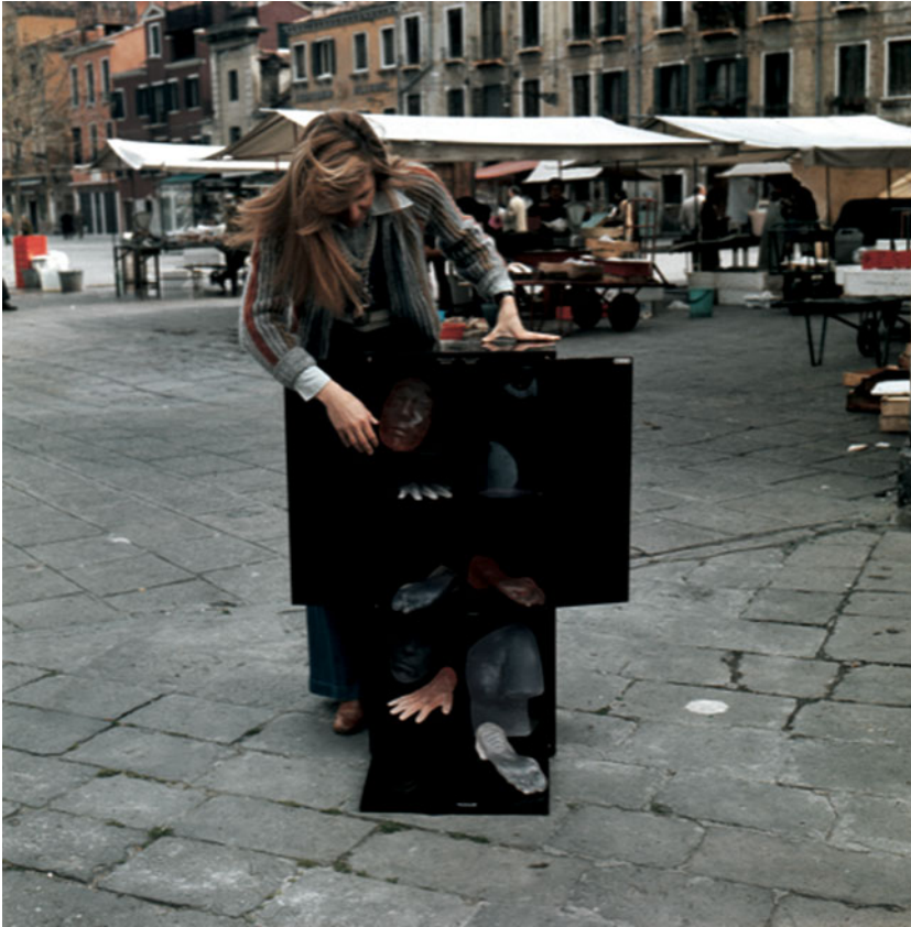
Figure 3. Federica Marangoni, Ricomposizione e vendita della memoria , 1975 (photo Fulvio Roiter, courtesy Federica Marangoni).

metal, glass or paper butterflies of Il volo impossibile ( The Impossible Flight ). In the latter cases Marangoni performs strong, vindictive or self-punishing gestures on her work, which has the shape either of the artist's body or of the insect popularly identified with the female sex. Therefore, it is only in Ricomposizione e vendita della memoria that Marangoni seeks to establish a close rapport with the public of passers-by and ordinary people, rather than with contemporary art enthusiasts, while later on the gestural and material symbolism she displays can only push the observers away, keeping them at a distance – like at the theatre – rather than close to the artist, or simply watching a recording, as in the case of the videotape of her performance of The Box of Life (1979).