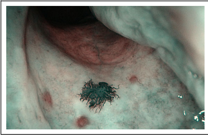
Figure 1. Spider angioma of the nasal mucosa. In this lesion, that is reminiscent of a spider's body, we recognize the 3 specific characteristics of the spider angioma: a body, legs, and surrounding erythema. The body appears as a visible arteriole units; the lesion is surrounded by capillary vessels that radiate in a way from spider legs, with reduced dimensions toward the edges.

lesion, the patient was put on follow-up by nasal endoscopy for potential growth.