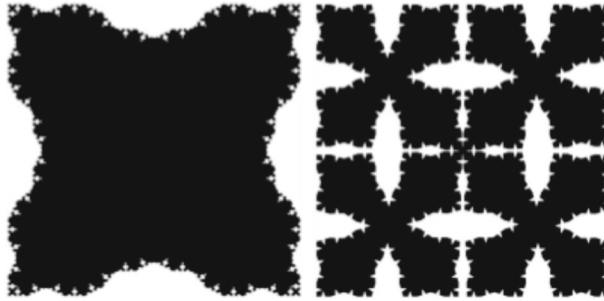
Figure 2. Inward curves