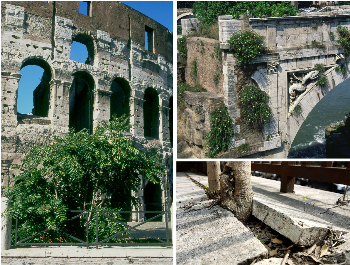
Fig. 1 Examples of the sites and of the plants studied in the historic centre of Rome, Italy. The invasive tree Ailanthus altissima growing close to the Colosseum (left). The native shrub Capparis spinosa , growing on the remaining arch of the

The 26 sites were chosen from a larger sample of 40 sites surveyed by the Roman botanist Anzalone (1951) after the Second World War, between 1946 and 1950.