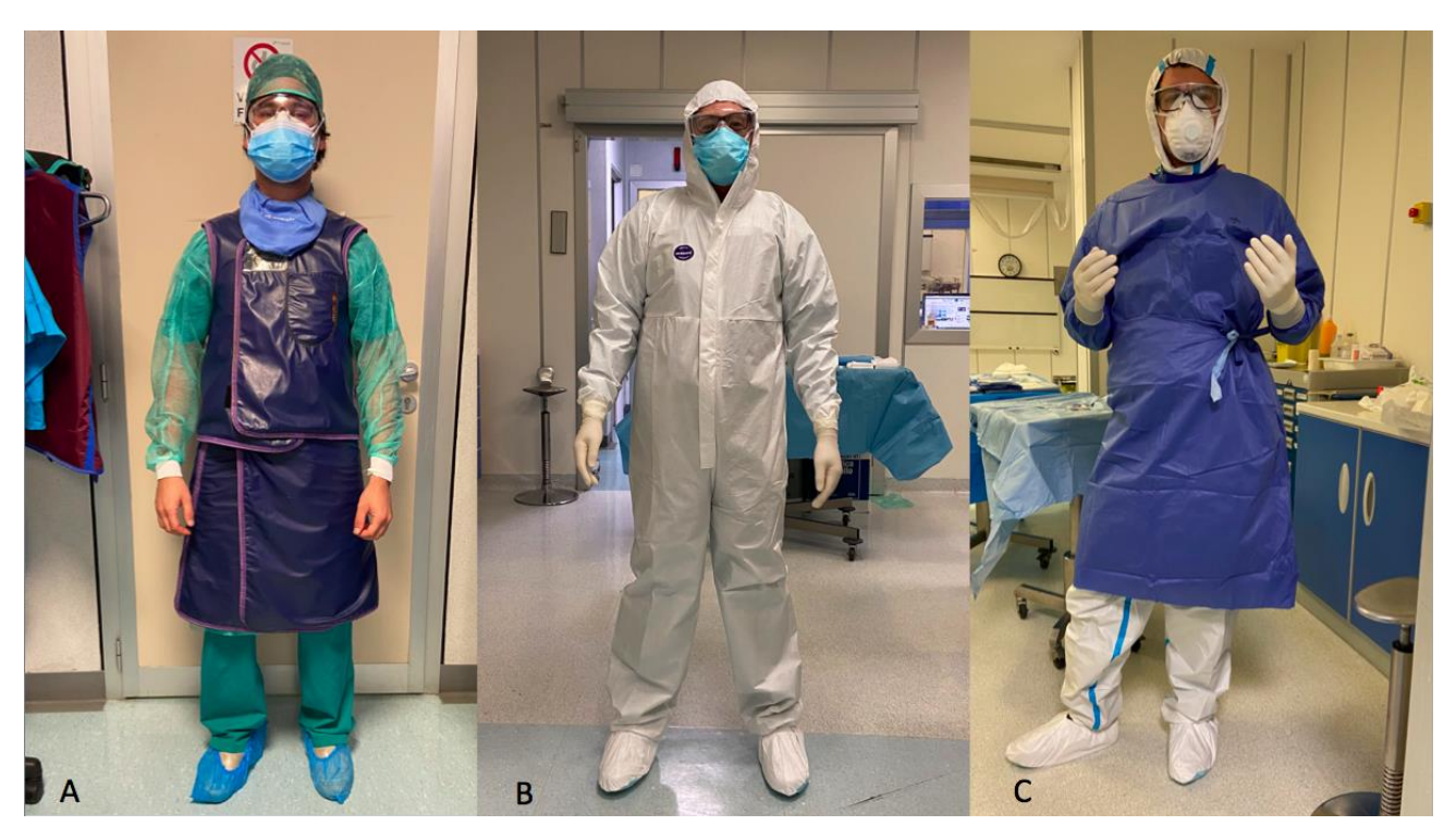
Figure 1. A-C Wearing protocol for confirmed or suspected COVID-19 patients. First step: operators wear lead gown, cap, eye protection, FFP2 or FFP3 mask, surgical mask in case of valved FFP2/3 mask and shoe covers (A); Second step: operators wear repellent coverall suite or gown and non-sterile gloves (B); Third step: operators wear sterile gown and gloves and start procedure (C).