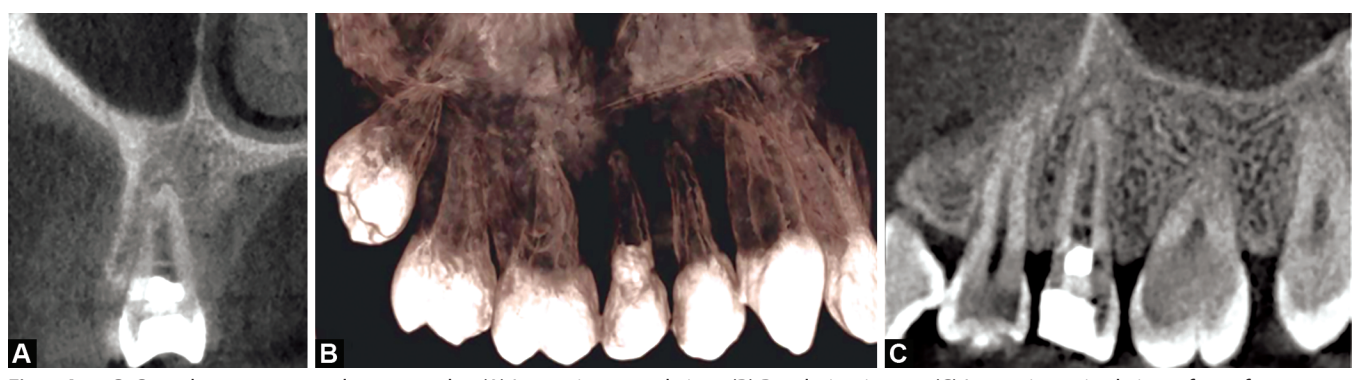
Figs 3A to C: Cone-beam computed tomography: (A) Image in coronal view; (B) Rendering image; (C) Image in sagittal view of 15, after 3 years, showing the tridimensional primary and secondary healing

thought to be similar to other REPs, provided that the main goals of the endodontic treatment (proper canal debridement, disinfection, and hermetic seal) were respected.