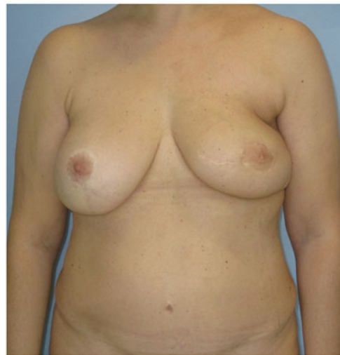
Figure 3. Frontal view 5 months after surgery. After 5 days, the flap slowly regained its normal aspect and follow up showed no liponecrosis.

pedicle 3 years after the transfer of a DIEP flap in a smoker, resulted in subtotal necrosis to Moolenburgh.[5] As far as we know, this is the first report of a positive outcome following local recurrence excision with interruption of the vein outflow in a DIEP flap, 4 years after its transfer for breast reconstruction. As reported in the literature, it has been shown that infection, tumour and radiotherapy at wound beds may delay the process of neovascularisation,[6,7] as well as tobacco use [5] and vascular insufficiency. In our patient, the non-smoking habit and lack of post-operative radiotherapy following quadrantectomy may have participated to the complete flap survival. Moreover, it has been demonstrated that the time lap necessary for neoangiogenesis is influenced by other factors, generally categorised as flap type and size.[1,3,6] Perforator free flaps, such as DIEP, are more likely to survive pedicle injuries than those with a high metabolic rate, like musculocutaneous flaps, depending also on the volume of transferred tissue.[3] In our case, on one hand, the high contact surface between the flap and the recipient area, being almost totally buried under a SSM, may partially explain the