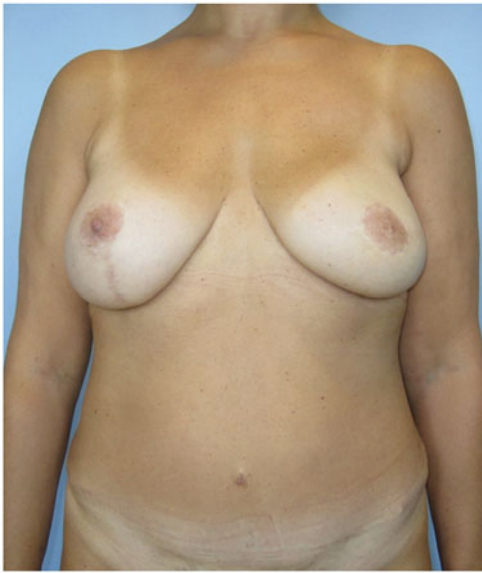
Figure 1. Frontal view. Patient with a previous left supero-lateral quadrantectomy and lymphadenectomy underwent left skin sparing mastectomy (SSM) and immediate DIEP flap reconstruction and contralateral mastopexy.