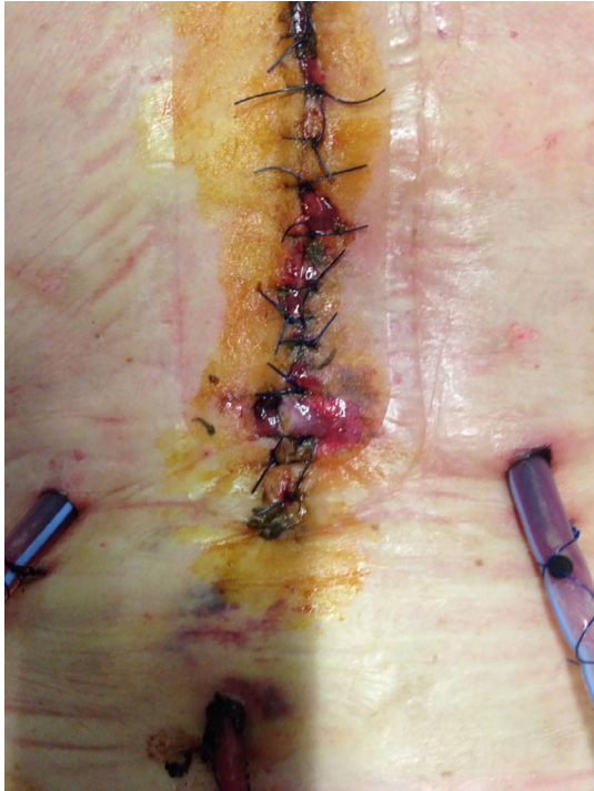
FIGURE 1 Preoperative time: sternal wound infection with closed drainage