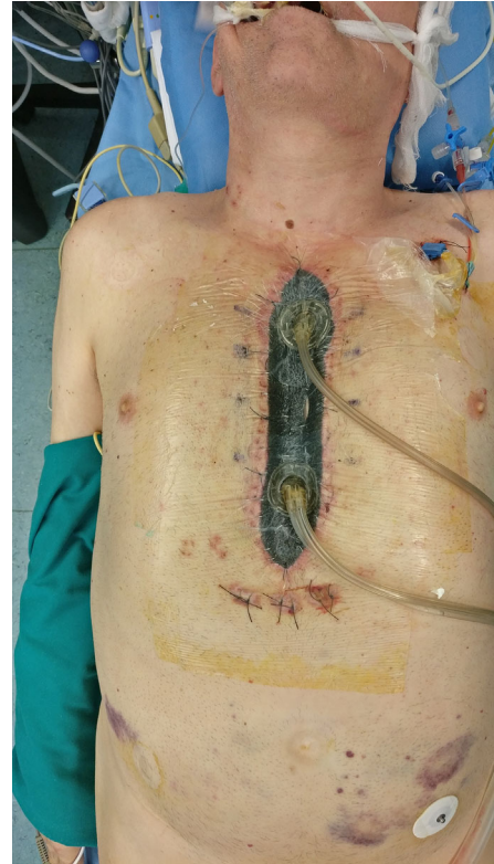
FIGURE 3 VAC-therapy placement