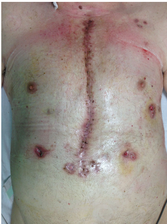
FIGURE 5 Postoperative picture at 30 days after surgery

Two or three drains were used and the wounds were taped with sterile non-woven tape.