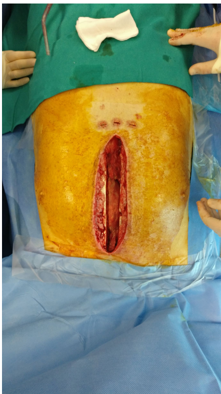
FIGURE 2 First step: surgical debridement

the wound. The two foams were covered with sterile drape and the layers were connected to the tube through a central and superficial hole. The effective negative pressure set was at -125 mmHg. VAC-therapy was replaced at least twice a-week and at each change, microbiological cultures were performed.