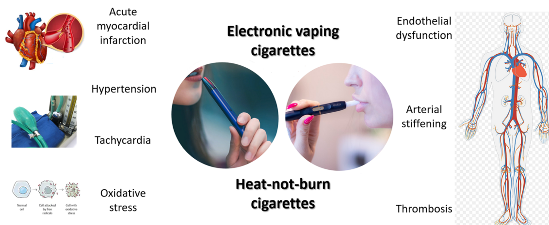
Fig. 1 Key adverse cardiovascular effects of electronic vaping cigarettes and heat-not-burn cigarettes

mechanisms involved in EVC toxicity are needed, exploring for instance microRNA, inflammatory cascade, autophagy, apoptosis, and regeneration [36–38]. Observational studies on large samples are needed to accurately gauge the short and long-term risks of EVC in apparently healthy subjects and in patients with cardiovascular disease [39]. In addition, randomized trials, from small-sample speculative ones to large pragmatic studies, are direly needed to ensure that the place of EVC in current clinical practice is correctly defined [40]. Indeed, our premise is that EVC should be considered as an over-the-counter medical intervention suitable to support chronic smokers in their journey to eventual cessation. Accordingly, only a comprehensive evidence platform, hopefully summarized in a formal network meta-analysis, will be able to precisely define the place and role, if any, of EVC in a comprehensive approach aiming at smoking cessation and harm minimization [41]. Pragmatically, and based on our personal and professional experience, we may suggest a stepwise use of EVC and HNBC with the eventual aim of total and